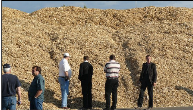
Shredded wood used to supply a small district heating plant.

The heating plant can be configured to use woody biomass as a feedstock (chips, shavings, pellets, etc.). Various configurations can utilize different combinations of renewable feedstocks, as well as traditional fossil fuels.