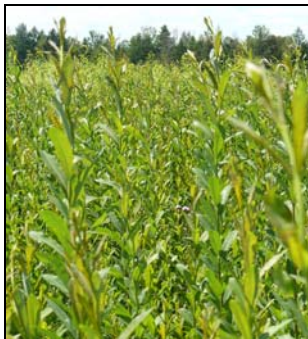
Willow genetics trial at the MSU Upper Peninsula Tree Improvement Center.

In the past, District Energy was used to help maintain snow-free and ice-free conditions on sidewalks and public areas, as well as for building heat. In the near future, District Energy may be an economical option to provide renewable, sustainable, and clean heat (and cooling) for business, government, and residential buildings. In some countries, a large and increasing portion of heating energy already comes from woody biomass.