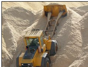
Raw material--ground wood.

The simplest technology for wood is direct combustion to produce heat. While wood has been used as a heat source for millennia, the technologies now employed to extract and distribute wood-generated heat vary. Many home furnaces, both indoor and outdoor, are inefficient and cannot be used where air quality standards apply.