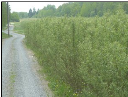
Willow energy plantation.

Employing appropriate wood-using technologies depends on the available wood resources, transportation systems, and existing wood-using facilities. Integrating systems with existing power plants and industries such as pulp and paper mills can increase market flexibility and spread costs over a larger infrastructure. Economies of scale might be gained by complementing and integrating a local operation.