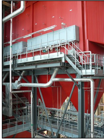
Large CHP plant boiler.

distributed through a District Energy grid. Efficiencies are high, and small to large cities can be served by CHP plants. St. Paul, Minn., has a CHP plant that largely runs on municipal solid waste. Both district heating and CHP plants can also produce pellets for local housing that is outside of the hot water grid or for sale to larger markets.