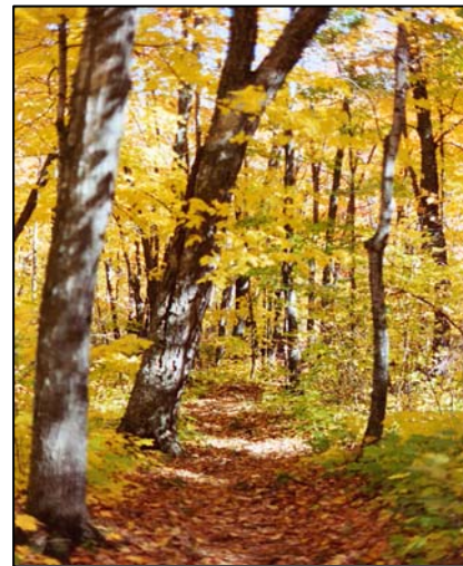
Northern hardwoods, Michigan's most abundant forest type.

Applying strategic planning to the bioeconomy on a statewide or regional scale will likely yield the best long-term alternatives. Pooling Industrial, governmental, and university resources has been a proven model to overcome environmental, social, and economic challenges in building a bioeconomy. Woody biomass, together with other renewable energy sources, will help reduce dependency on fossil fuels and improve our lagging rural economy.