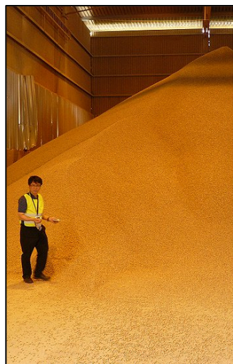
Pellet storage area.

Nevertheless, they remain practical and low-cost alternatives in some situations. Some manufacturers have produced more efficient home furnaces that do meet air quality standards.