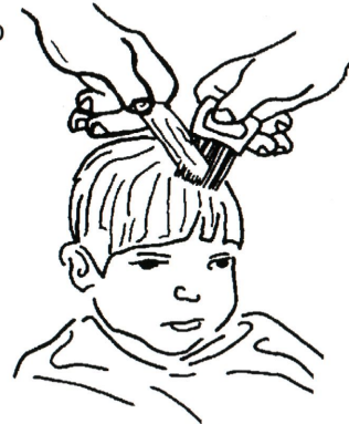
Comb hair with a special nit comb.

For advice on how to control head lice, contact your physician, local health department, and/or school nurse.