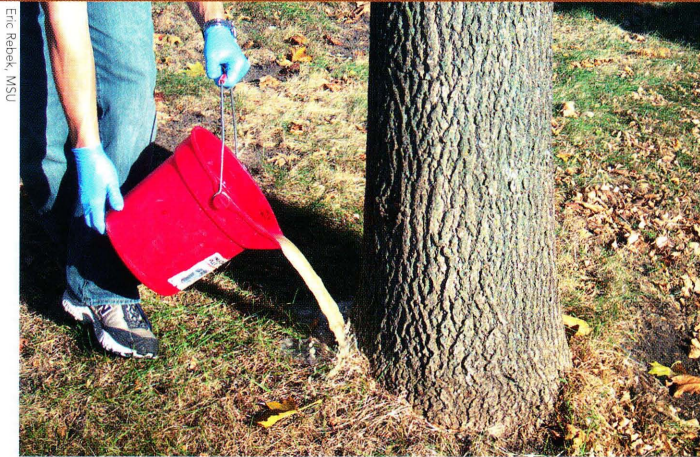
Application of soil drench around tree base.