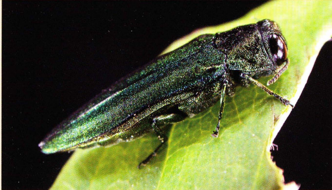
Emerald ash borer adult

Several insecticide products are available to homeowners for control of emerald ash borer (EAB). Treatments are needed every year to protect trees from EAB. Treatments are recommended only for homeowners in the quarantined area; it is not necessary to treat ash trees outside of this area. Treatments may be more effective if overall tree health is maintained. Therefore, it is important to fertilize trees in the fall or spring and water regularly.