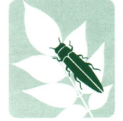
Emerald Ash Borer

an integral component of a healthy ecosystem, creating nesting sites for birds, sheltered cavities for mammals and structure for a variety of other organisms. Safety, however, should be your top priority — if you think that the tree could be a hazard for you or others, be safe and remove it.