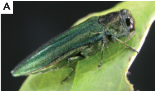
Michigan State University