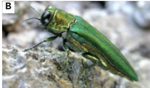
Michigan State University