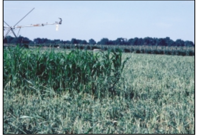
Chopped and standing sudangrass used as a green manure for tomato and cucumber production in Berrien Co.

Growers with sufficient land can dedicate an area to growing a summer cover crop such as sorghum/Sudan grass or alfalfa that is established in a vegetable system, but then chopped and not removed. This may be one of