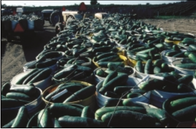
Cucumber harvest from Berrien Co. Cover crops rotated with corn, cucumbers and tomatoes help improve overall yields.