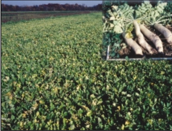
Oilseed radish bulk seeded after cucumber harvest. These plants winterkill and large roots leave holes in the soil.

heavier soils and may be particularly suited to rehabilitating sites with inadequate drainage, surface soil compaction or soilborne disease problems. The relatively fast cycling time of brassica means that some varieties are adapted for use in a short window of time where other, slower growing covers may not produce sufficient growth. Further, the combined amount of above- and belowground biomass from oilseed radish is substantial. As shown in Figure 1, the weed suppression associated with oilseed radish can be highly effective.