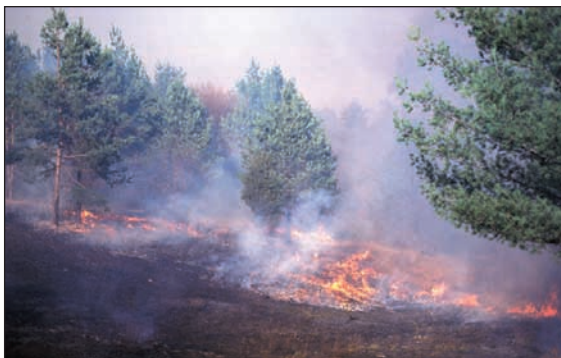
Figure 1. Most wildfires are smaller fires that do not make the evening news.

Typically we think of states such as Colorado, Arizona and California as being prone to wildfires. But Michigan experiences an average of 8,000 to 10,000 wildfires each year. Most of these are small fires that do not make the evening news (Figure 1). But even these small fires can damage or destroy homes and property. Approximately 100 homes are lost or damaged each year by wildfires in Michigan. Wildfires occur in every county of the state. According to the Michigan Department of Natural Resources (MDNR), between 1950 and 1996, the MDNR and the U.S. Forest Service were involved in suppressing 46,100 wildfires that burned 390,000 acres of forest (Michigan State Police Emergency Management Division, 2001).