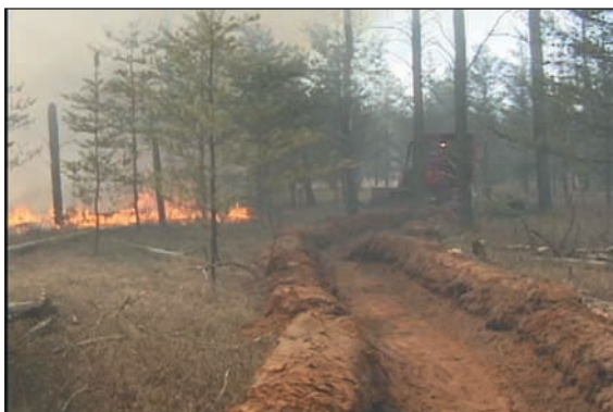
Figure 3. Creating a fuelbreak.

Large wildfires can move rapidly across the landscape, though not like a tidal wave, as is often depicted in the media. A wildfire moves from point to point across the ground as its requirements for heat and fuel are met. If an area contains no fuel, the fire will not go there. This is why wildland firefighters typically control wildfires by removing all vegetation (fuel) down to mineral soil to create a fuelbreak (Figure 3).