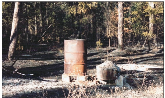
Figure 2. One-third of Michigan wildfires are caused by debris burning.

Wildfires can start in many ways, but about 98 percent of fires are caused by human activities. One-third of all wildfires are caused by people burning debris (household and yard waste, Figure 2). A moment's inattention or an unexpected change in the weather can rapidly turn a debris fire into a wildfire. Once a wildfire starts, it may be impossible for a homeowner to put out.