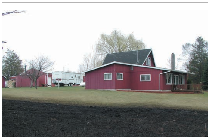
Figure 4. Wildfires cannot burn where there is no fuel.

The amount of radiant heat a wildfire can transfer to your home depends on how far the fire is from the structure and how long it stays there. Research has shown that it is impossible for the radiant heat from a wildland fire to ignite a typical wood-sided home from more than 100 feet away. In fact, in simulations with actual fires and in case studies, homes as close as 33 feet from a wildfire have survived if the flames cannot actually touch the structure (Figure 4).