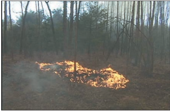
Figure 5. Firebrands can start new fires.

It's firebrands that pose the greatest danger to homes — far more than the flames themselves. These wind-driven embers can be blown under decks and porches, into cracks in the foundation, and into attics through faulty eave and roof vents. They can also land in combustible vegetation adjacent to the home and ignite it, and these flames then can ignite the home. This makes the area within 3 feet of the home the most important. Firebrands can land here and ignite a new fire at the home's most vulnerable point.