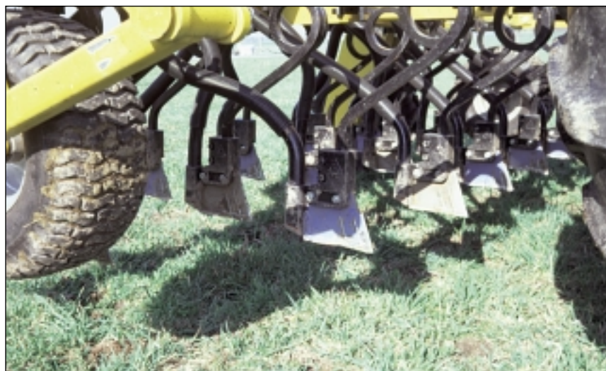
A no-till drill with coil tine and sod-slicing Baker Boot opener without a disc coulter used in overseeding pastures.

When selecting a liming material, it is important to understand differences between them. Lime is calcium oxide. However, in agriculture, "lime" is any Ca or Mg compound capable of neutralizing soil acidity. "Lime requirement" is the amount of material needed to increase the soil pH to a particular point or reduce soluble aluminum.