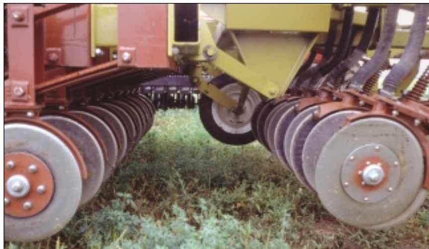
A no-till planter showing seed openers and steel press wheels.

Take soil samples after harvest in the fall or before planting in the spring. Fall sampling is preferred if lime applications are anticipated. Other advantages of fall sampling include dry soil (soils are normally drier in the fall than in the spring) and lead time for planning and fertilizer purchase. Soil samples taken in the spring usually test higher than fall samples, so keep the sampling time the same from year to year for long-term comparisons. Fields should be