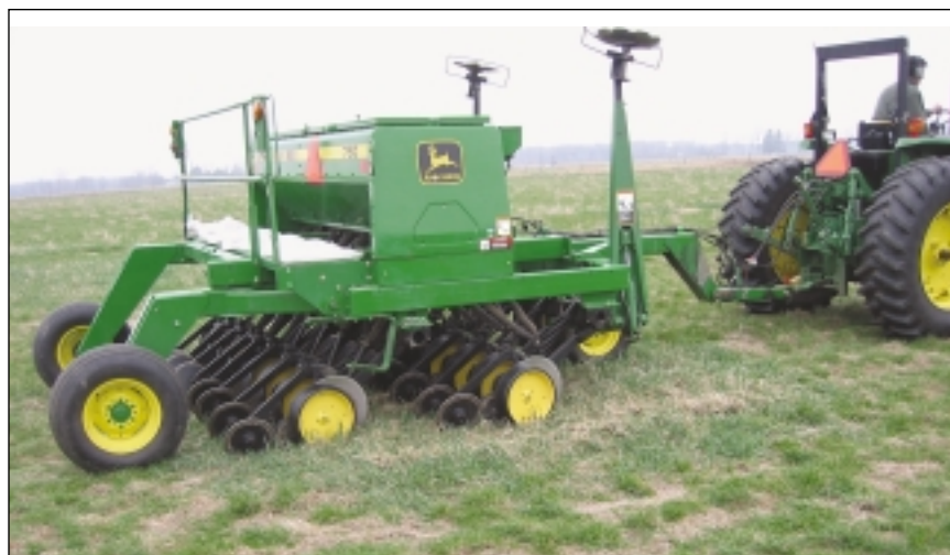
Interseeding into an existing pasture to improve stand density (note bare areas in the pasture.)

Sample distribution usually depends on the degree of variability in a given area. In relatively uniform areas smaller than 20 acres, a composite sample of 20 cores taken in a random or zigzag manner is usually