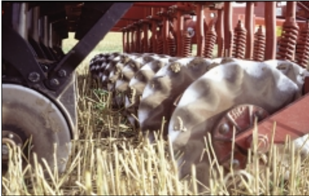
Fluted coulters need to be adjusted for downward pressure for proper zone tillage.