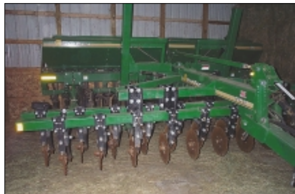
A no-till drill with fluted coulters for ease in cutting through crop residue.