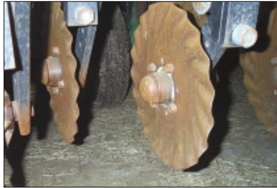
Fluted coulters are used for cutting through crop residue.

Three types of furrow openers are commonly used on disk drills: double-disk openers, single-disk openers and offset