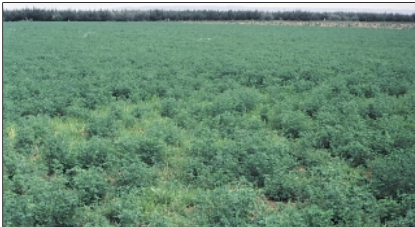
An established field of alfalfa showing significant stand decline caused from poor internal soil drainage. The use of tile drainage or selection of another species such as birdsfoot trefoil would be appropriate in this situation.

well-drained or tilled, all soil management groups (soil classes 1 to 5) and all textures are suitable for no-till establishment and production of alfalfa and other forage crops such as cool- and warm-season grasses and other legume crops.