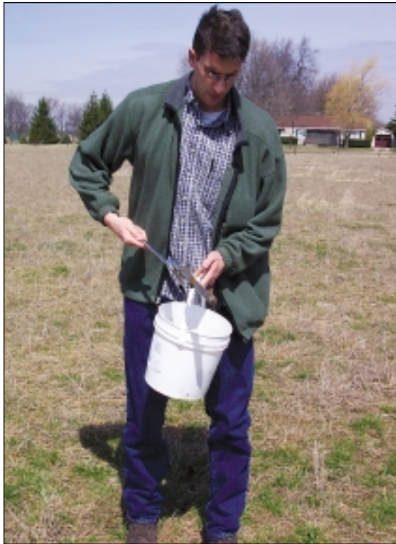
Collect 20 cores in a random manner and place into a plastic bucket for mixing.

"Neutralizing value" or "calcium carbonate equivalent" compares a liming material to pure calcium carbonate. Calcite is pure calcium carbonate and contains 40 percent calcium. Dolomite is a mixture of calcium and magnesium carbonate and contains 21.6 percent calcium and 13.1 percent magnesium. Analyses of limestone materials range widely. There are no clear standards for the term "calcitic or dolomitic limestone". Generally, if a liming material is greater than 2 percent magnesium, it is called dolomitic limestone; otherwise it is called calcitic limestone. Most liming materials are mixtures of calcium and magnesium carbonate. Neutralizing value is usually