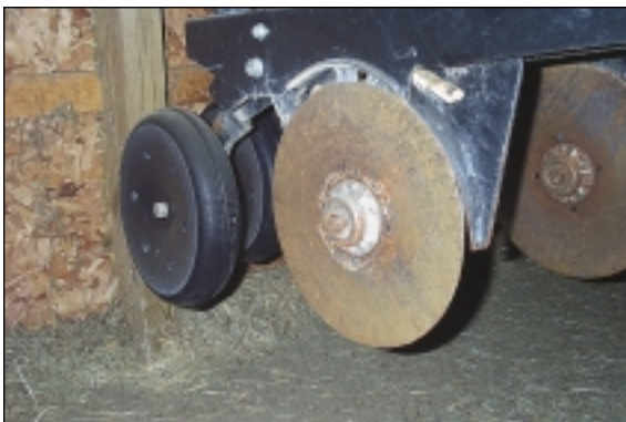
Seed opener and press wheel.

Coulters depth adjustments vary among drills. Depth adjustments usually involve moving clips to increase pressure on the opener rod pressure rings or adjusting the depth rod on the gauge-pressure wheel assembly. Depth control is not as precise with no-till drills as with row-crop planters, unless the drills have depth control bands on the furrow opener similar to those on a row crop planter. When planting condi-