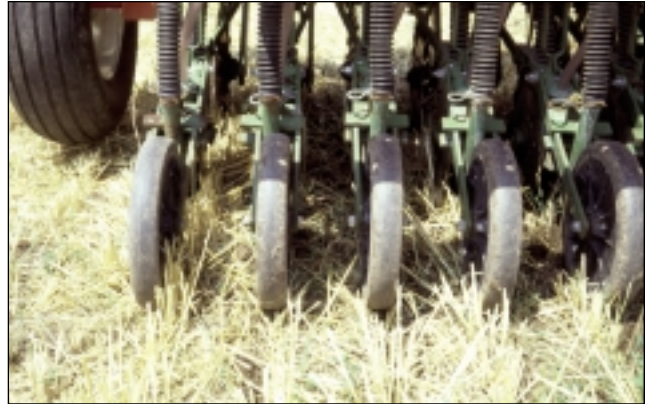
Adjust downward pressure of press wheels for good soil-seed contact.

tions are good, the coulters can be set to run at the depth of seed placement. As long as the residue is being cut, the furrow opener will be able to place the seed near the desired depth, but the actual depth will vary with soil conditions — placement will be shallower in hard soils and deeper in soft soils. If the soil is not being thrown out of the seed furrow, the cutting coulters can be set deeper than the desired depth of seed placement. Running the coulters deeper may provide more loose soil for seed coverage but may cause even more soil to be thrown from the furrow.