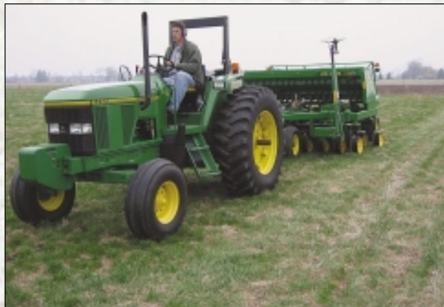
Improving a pasture by no-till seeding legumes into a grass sod.

What are the advantages of no-till in forage production? Firstly, no-till maintains a lot of crop residue that provides a significant amount of organic matter to the soil. Crop residues on the soil