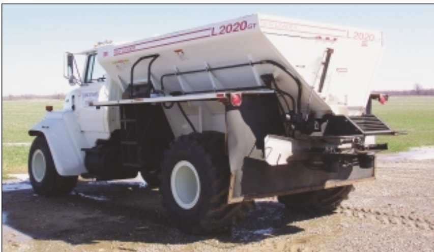
Lime should be spread one year prior to planting.

Downward pressure is adjustable according to field conditions. The weight of the drill is transferred to the cutting coulters and the opener assembly through the pressure springs or rubber buffers. The pressure springs or rubber buffers maintain pressure on the coulters for residue cutting and soil penetration yet allow the coulters to trip and reset if it encounters rocks or other obstructions. If the residue is not cut cleanly, it may bunch up in front of the furrow opener and plug the drill, or the residue may get pinched into the bottom of the seed furrow.