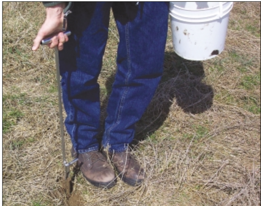
Collect soil cores with a sampling device like this step-in soil probe.

Factors that affect reaction time of a liming material include particle size and surface area or porosity of the material. If the liming material source is one that reacts slowly, you must allow more time before growing a pH-