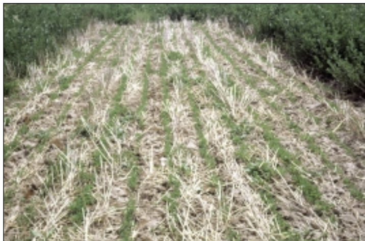
Legume establishment into wheat stubble using a no-till planter.

Non-uniform areas should be subdivided on the basis of obvious differences such as slope position or soil type. Soil samples used for nutrient recommendations should be taken to a depth of 6 inches. When nitrogen fertilizer is on the surface of no-till fields for a number of years, the