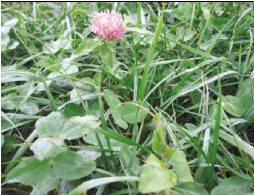
Red clover successfully established into a grass pasture.

Insect Control. Insect damage to grass forages during establishment is generally not a concern, but insect feeding can devastate legume forages, especially alfalfa. Potato leafhopper is the primary insect of concern. Potato leafhoppers can reduce the vigor and later performance of alfalfa seedlings. Proper monitoring and control when the economic threshold has been reached are extremely important during alfalfa establishment. When alfalfa is direct drilled into old sods, grasshoppers can be especially destructive to new seedlings during a dry spell. For more information on insect control in forages, refer to MSU Extension bulletin E-1582, "Insect and Nematode Control in Field and Forage Crops", available from the MSU Bulletin Office, Michigan State University, East Lansing, MI 48824 ($3).