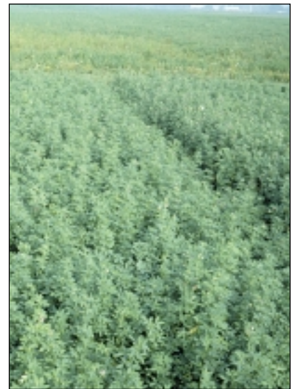
Results for no-till alfalfa are similar to those for alfalfa established using conventional tillage with modern drills.

Autotoxicity in alfalfa is a process in which established alfalfa plants produce chemicals that escape into the soil and reduce establishment and growth of adjacent new alfalfa. Negative effects of autotoxicity can remain in the field even after the plants are killed and inhibit growth of the new alfalfa if it is planted too soon after the death of the old stand. The main effect of alfalfa autotoxicity is reduced development of the seedling taproot.