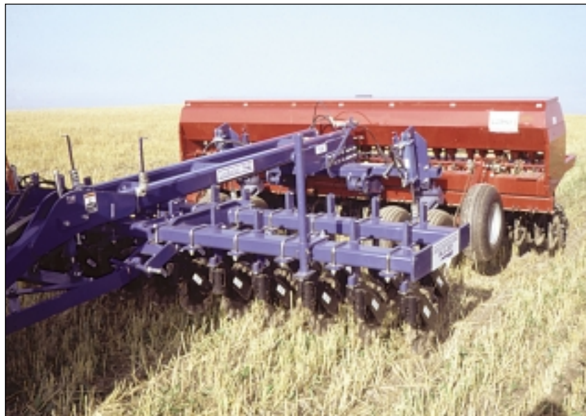
No-till planting into row crop or small grain stubble usually results in better stands than planting into old sod.

including high density stocking rates, limited grazing time and access to water in each paddock — ensure good distribution of manure and even forage consumption. If stocking rates are low or water sources are too far away, uneven distribution of manure will occur with subsequent poor distribution of plant nutrients.