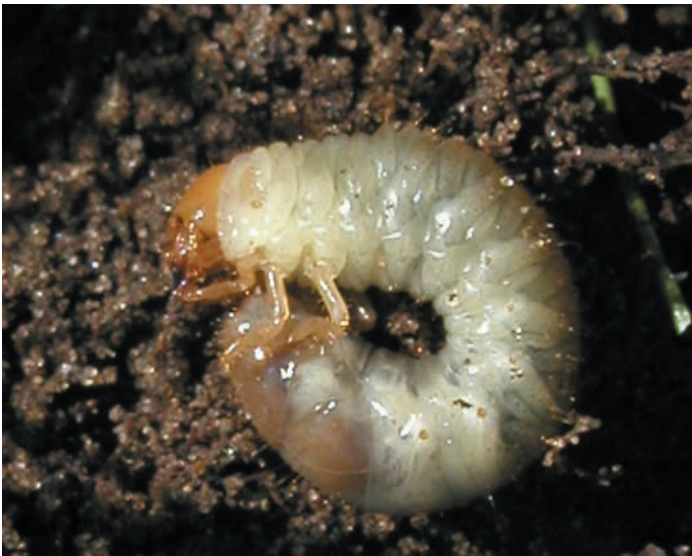
Figure 3. Fully grown third instar grub of Japanese beetle.

Larvae (also known as grubs) are 2 to 3 mm long when newly hatched; fully grown larvae are about 30 mm long (Figure 2). Larvae are C-shaped and white with a brown head capsule and three pairs of legs (Figure 3).