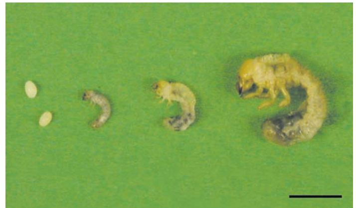
Figure 2. Relative sizes of eggs and first, second and third instar Japanese beetle grubs. Bar = 5mm.

Eggs are 1 to 2 mm in diameter, spherical and white (Figure 2). Females lay batches of eggs 5 to 10 cm below the soil surface, generally in areas with grass and moist soil.