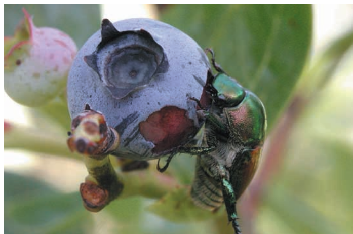
Figure 1. Adult Japanese beetle feeding on ripe blueberry.

Adults are about 13 mm long (Figure 1). The head and thorax are metallic green, and the rest of the upper surface is copper-colored. Five tufts of white hairs on both sides of the lower surface and a sixth pair on the tip of the abdomen are distinguishing