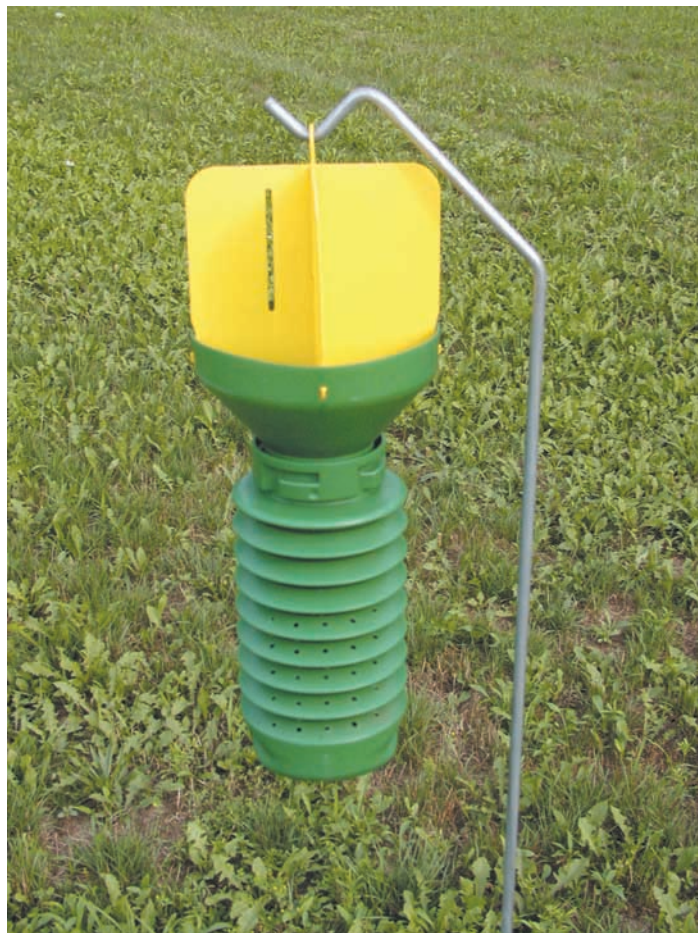
Figure 6. Monitoring trap for Japanese beetle.

Cultural control. One of the most effective control tactics is to make crop fields and nearby areas less suitable for Japanese beetle by integrating many cultural approaches into regular horticultural prac-