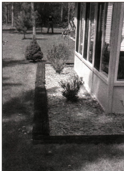
Figure 2. Flammable mulches and evergreen shrubs can burn intensely.

ly) the “ember blizzard” that is usually associated with a wildfire. These burning embers, blown by the wind ahead of the main fire, can land in and ignite dead leaves, wood chips and other flammable material next to the structure.