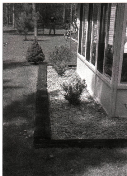
Figure 2. Flammable mulches and evergreen shrubs can burn intensely.

ly) the “ember blizzard” that is usually associated with a wildfire. These burning embers, blown by the wind ahead of the main fire, can land in and ignite dead leaves, wood chips and other flammable material next to the structure.