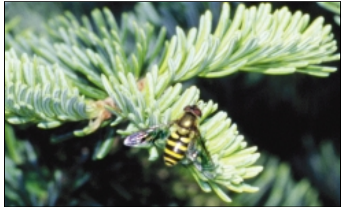
Figure 6b. Syrphid fly adult.