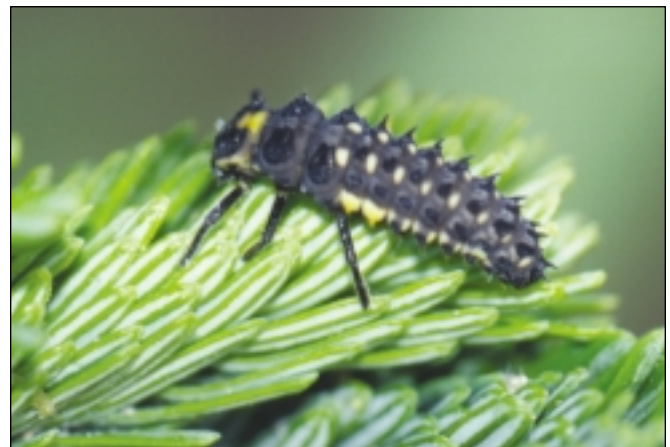
Figure 9c. Ladybird beetle larvae are important predators of balsam twig aphid.