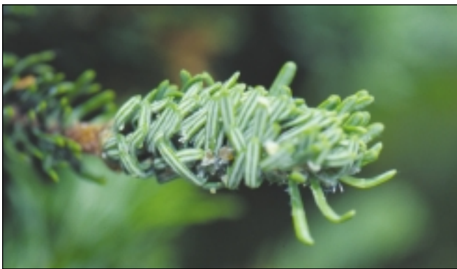
Figure 3. Aphid feeding causes needles to curl tightly.

Feeding by the second generation of aphids (the sexuparae) in the swelling buds and expanding needles can affect the growth and appearance of trees. At low aphid densities, some needles on infested shoots will bend or curl slightly, but this rarely causes noticeable damage (Fig. 4). When aphid densities are high, however, current-year needles become distorted and appear to be curled or wrapped around the shoot (Fig. 5). When this level of damage occurs, needle growth may be reduced, causing the current-year shoots to appear stunted. If heavy feeding occurs in consecutive years, tree vigor and growth rates may decline. Balsam twig aphid rarely kills trees, but reduced tree growth and appearance can decrease tree value and reduce profits for growers.