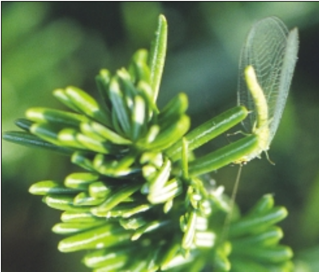
Figure 8b. Green lacewing adult.