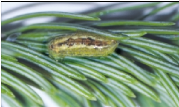
Figure 6a. Syrphid fly larva.

Brown lacewings (Fig. 7) are predators of aphids as both adults and larvae. Brown lacewing adults overwinter in the litter layer, emerge early in spring and lay eggs that will hatch about a month later. The small brown lacewing larvae