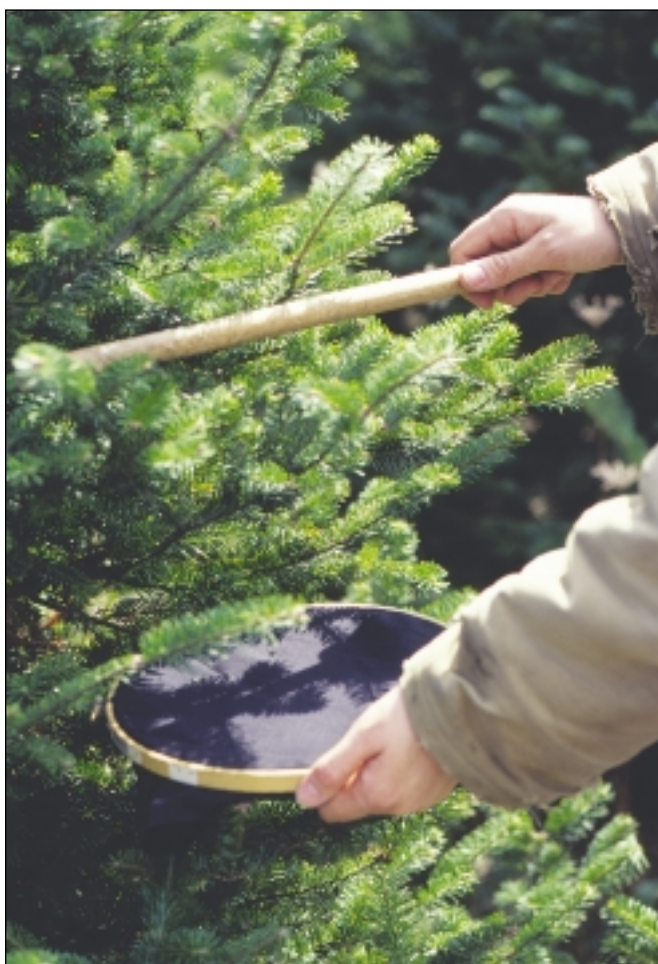
Figure 10. Use an embroidery hoop with black cloth and a dowel to sample aphids.

Genetic factors appear to play a role in the timing of bud break, which affects the extent of aphid damage that fir trees sustain. Many varieties of balsam fir, for example, break bud before Fraser fir trees, even when they are growing side by side. Even within a species, some trees are genetically programmed to break bud relatively late in spring. Identifying the individual trees, varieties or species of fir that break bud late may help reduce aphid damage in the short term as well as the long term. For example, it may be beneficial to harvest trees with early bud break as soon as they reach saleable size. Trees with late bud break are less likely to be affected by aphid feeding and could be retained until they reach a larger size. In the long term, identification and selective propagation of trees that have consistently late bud break may help to reduce balsam twig aphid populations in Christmas tree plantations throughout the state.