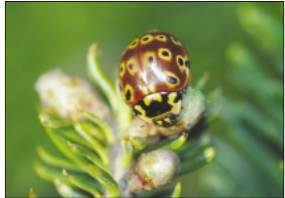
Figure 9b. Anatis mali , the largest native ladybird beetle, begins feeding on aphids in early spring.

Scouting: Effectively managing balsam twig aphid requires early-season scouting and decision making. One of the first steps in managing balsam twig aphid is to evaluate the amount of damage from the previous year. This can be done in late autumn or in early spring. Walk diagonal transects that zigzag through your field. Check mid- and lower canopies, as well as the upper canopy, for damage. If you find little or no aphid damage, treatment is unlikely to be needed this year. When you observe damage, make notes or draw a map of affected areas so that you can prioritize them for future monitoring or control activities.