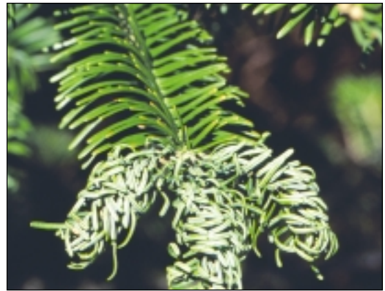
Figure 5. Heavy damage caused by high aphid populations.

A unique aspect of the interaction between fir trees and the aphids is the ability of trees to outgrow much of the aphid damage. Feeding by the aphids is typically completed by mid- to late June. Current-year needles, however, will continue to grow during the remaining summer months. By autumn, many of the needles will have recovered their form. Studies in Michigan, Wisconsin and North Carolina consistently show that trees outgrow 40 to 50 percent of balsam twig aphid damage by autumn. This means that trees that have moderate or high levels of aphid damage in late June will look much better at harvest time. Some aphid damage can also be removed by clipping off affected shoots when trees are sheared.