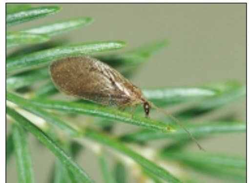
Figure 7. Brown lacewing adult.

are difficult to see, but they actively hunt for aphids in the buds and shoots. Adults can be observed preying on aphids or laying eggs once temperatures warm up in the spring. They often “play dead” when disturbed.