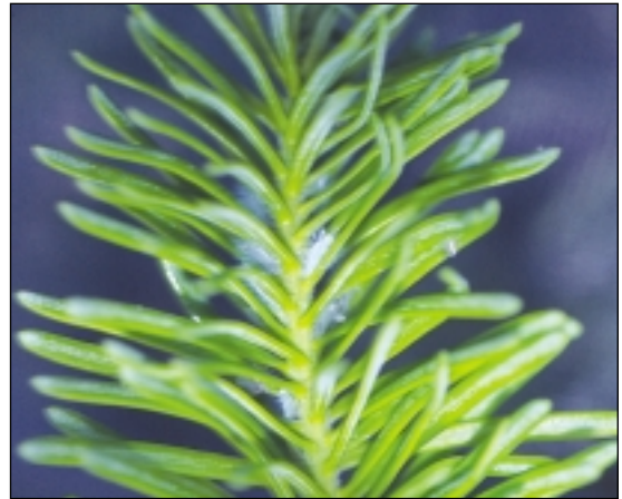
Figure 4. Light damage caused by low to moderate aphid populations.