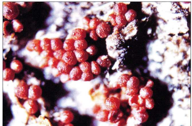
Perithecia of the exotic pathogen Nectria coccinea are bright red.

Both the native and exotic fungi produce fruiting bodies called perithecia. Perithecia of N. galligena and N. coccinea var. faginata are tiny and bright red and occur in clusters on living or dead bark. Perithecia of N. ochroleuca are lighter in color — usually salmon or pink. Each perithecium is filled with sacs of spores. These spores are the sexual stage of the fungi. Spores are released from perithecia in the fall and can be carried in the wind. On some infected trees, perithecia are abundant, causing large areas of the bark to appear red. In Michigan and some other areas, however, perithecia can be difficult to find.