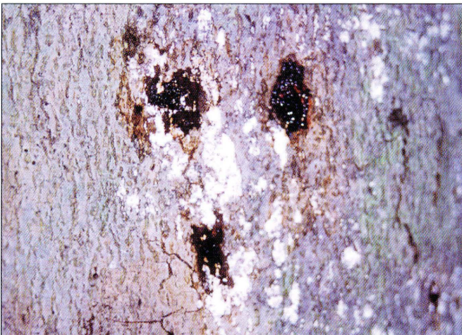
Tarry spots can indicate Nectria infection.

Typically only the bark and inner bark are killed by the Nectria fungi, but occasionally dead areas may extend into the sapwood when the cankers are infected by other fungi. The Nectria fungi may infect localized areas on the tree, causing linear strips of bark to die along the tree trunk or branches. If larger or more numerous areas are infected, the tree may be girdled and killed. If the fungus invades only narrow strips of bark on vigorous trees, callus tissue often forms and the bark becomes rough. Sometimes the tree is able to wall off these cankers if they are small. If beech scale numbers are high, however, Nectria often spreads or coalesces rapidly and is not likely to be restricted by callus formation. Scales cannot survive on tissue that has been killed by the fungus. A strip of scale-free bark running down an otherwise infested tree often indicates where bark has died.