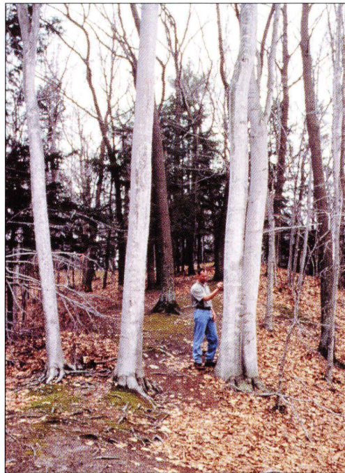
Heavily infested trees appear to be whitewashed.

are growing near heavily infested trees. These trees may be resistant or at least partially resistant to beech scale. Resistant trees often have smooth bark, but this may not always be the case. Resistant trees may occur in clumps or groups if they originated as root sprouts. However, resistant trees that regenerated from seed may be scattered through the stand. In eastern Canada, five to six trees per acre were resistant to beech scale. Identification and retention of potentially resistant trees is an important step for conserving the beech resource over the long term.