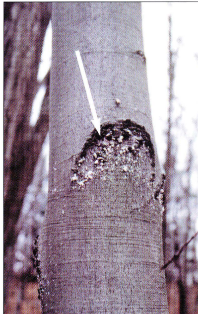
Beech scales first become established on rough areas of the bark, such as old branch stubs.

Symptoms of scale infestation: Crawlers prefer to colonize areas of the tree where the bark is rough. Newly infested trees usually have the first small spots or patches of “white wool” on the trunk around areas of rough bark. Infestations often start near old branch stubs, under large branches, or sometimes beneath mosses or certain lichens. As the scale population builds, the entire trunk and large branches of the tree may be covered with white wool.