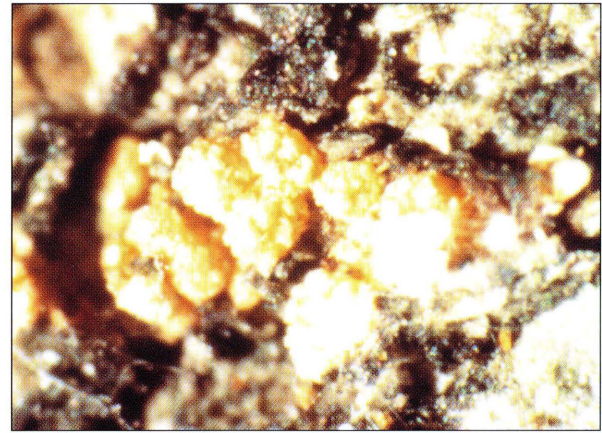
Perithecia of Nectria ochroleuca are light-colored.

Three species of Nectria fungi are associated with beech bark disease in North America. Nectria galligena is a native pathogen that causes perennial cankers on many hardwood species. It rarely affects beech, however, unless beech scale is present. Another species, Nectria coccinea var. faginata , is an exotic pathogen that was introduced from Europe. Often, the native Nectria species is the first to invade trees infested by beech scale, followed by the exotic Nectria species. A third Nectria species, N. ochroleuca , has been found in association with beech bark disease in Pennsylvania, West