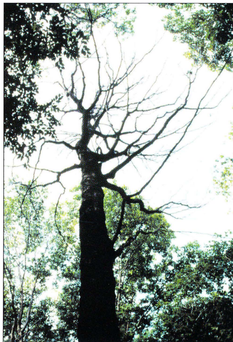
Dead beech trees provide wildlife habitat.

produce substantial numbers of nuts at about age 40. By age 60, large nut crops are produced every 2 to 8 years. This hard mast is especially important in northern forests where oak and hickory are rare. Branching characteristics of beech trees make them attractive to raptors for perches, and several species of hawks prefer to nest in beech trees. Standing beech trees that have some decay are used for