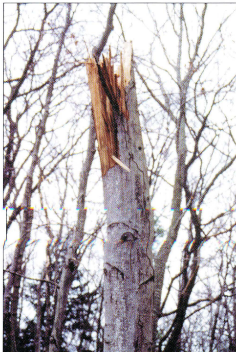
An example of beech snap.

superficial. Trees with raised lesions or blocky bark (indicating that Nectria was walled off) had little or no wood defect. Most defects were removed with the bark slab at the sawmill. Sunken lesions could cause defects over time, usually because of bark inclusions buried in wood. Defects associated with sunken bark lesions generally affected lumber grade rather than volume. Trees that were heavily infested by scale and had large patches of dead bark had extensive wood defects or, more typically, died.