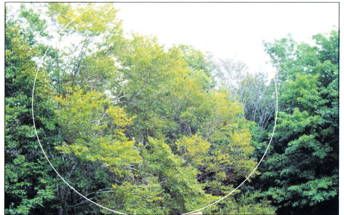
Foliage of infected trees appears yellowish.

Trees dying from Nectria infection usually have a distinct appearance when viewed from a distance. Leaves that emerge in spring do not mature and crowns appear thin or ragged. Leaves remain on the trees but become yellowish later in the summer.