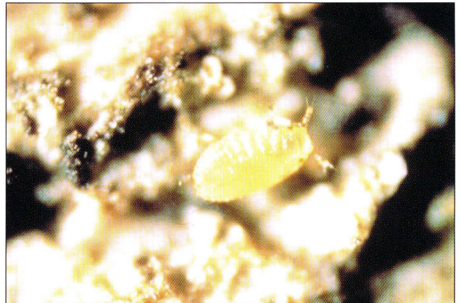
An immature beech scale.

and legs and can move about. When a crawler finds a suitable location on a host tree, it forces its long, tubelike stylet into the bark and begins to suck sap from the tree. Once a crawler begins to feed, it will molt to the second stage. Second-stage crawlers have no legs and are immobile. They produce the white wax that eventually covers their bodies. Second-stage crawlers overwinter and molt to the adult stage the following spring.