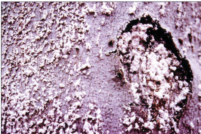
Beech bark scales secrete a white waxy covering that looks like wool.

Life cycle: Beech scale has one generation per year. Adults lay pale yellow eggs on the bark in midsummer, then die. Eggs are attached end-to-end in strings of four to seven eggs. Eggs hatch from late summer until early winter. The immature scales that hatch from eggs are called crawlers or nymphs. Unlike adults, crawlers have functional antennae