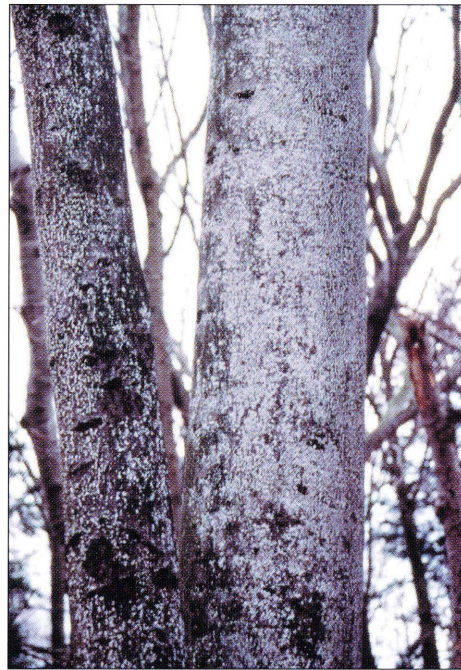
Beech bark disease begins when beech scale infests a tree.

B eech bark disease is one of the latest exotic pest problems to plague Michigan forests. Beech bark disease refers to a complex that consists of a sap-feeding scale insect and at least two species of Nectria fungi. Beech bark disease begins when American beech ( Fagus grandifolia ) becomes infested with beech scale ( Cryptococcus fagisuga Lind) (= Cryptococcus fagi Baer.). The tiny scale insects, found on the tree trunk and branches, feed on sap in the inner bark. White wax covers the bodies of the scales. When trees are heavily infested, they appear to be covered by white wool. Minute wounds and injuries caused by the scale insects eventually enable the Nectria fungus to enter the tree. Nectria kills areas of woody tissue, sometimes creating cankers on the tree stem and large branches. If enough tissue is killed, the tree will be girdled and die. Other trees may linger for several years, eventually succumbing to Nectria or other pathogens. Some infected trees will break off in heavy winds — a condition called “beech snap.” Dense thickets of root sprouts are common after trees die or break.