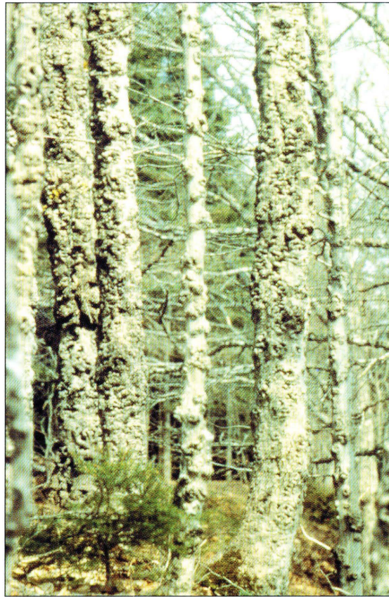
Affected trees with lesions in the Aftermath Forest.

Salvage dead or declining trees with thin crowns and yellowish foliage. These trees are often invaded by secondary decay fungi that can degrade wood within 2 to 3 years. Remove trees with sunken lesions or large patches of dead wood — these trees are likely to have defects. Consider retaining some large trees to provide wildlife habitat.