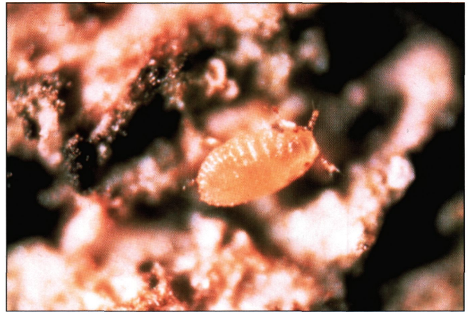
An immature beech scale.

and legs and can move about. When a crawler finds a suitable location on a host tree, it forces its long, tubelike stylet into the bark and begins to suck sap from the tree. Once a crawler begins to feed, it will molt to the second stage. Second-stage crawlers have no legs and are immobile. They produce the white wax that eventually covers their bodies. Second-stage crawlers overwinter and molt to the adult stage the following spring.