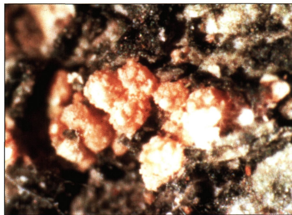
Perithecia of Nectria ochroleuca are light-colored.

Three species of Nectria fungi are associated with beech bark disease in North America. Nectria galligena is a native pathogen that causes perennial cankers on many hardwood species. It rarely affects beech, however, unless beech scale is present. Another species, Nectria coccinea var. faginata , is an exotic pathogen that was introduced from Europe. Often, the native Nectria species is the first to invade trees infested by beech scale, followed by the exotic Nectria species. A third Nectria species, N. ochroleuca , has been found in association with beech bark disease in Pennsylvania, West