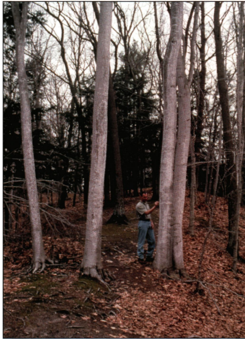
Heavily infested trees appear to be whitewashed.

Favor regeneration of other tree species via selection or planting.