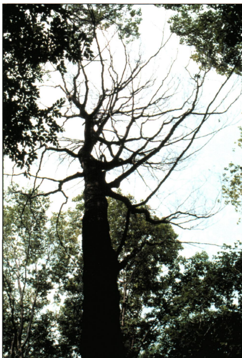
Dead beech trees provide wildlife habitat.

The first wave of beech bark disease in northern Pennsylvania forests killed roughly 50 percent of the beech trees larger than 10 inches in diameter at breast height (dbh). Another 25 percent of the trees lived but were infected by Nectria . These trees were weak, grew slowly and had patches of dead tissue. The remaining 25 percent of the trees either escaped scale infestation or Nectria infection or are at least somewhat resistant. In Maine forests, where beech bark disease has been present for more than 60 years, most large-diameter beech trees have been killed. Trees that escaped heavy scale infestation often remained alive but were highly defective.