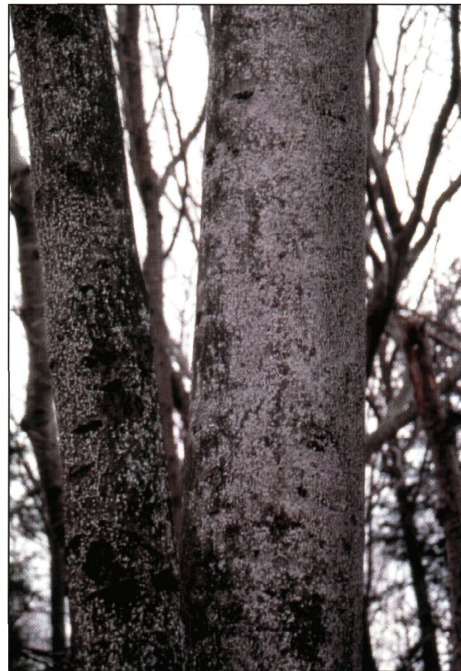
Beech bark disease begins when beech scale infests a tree.

B eech bark disease is one of the latest exotic pest problems to plague Michigan forests. Beech bark disease refers to a complex that consists of a sap-feeding scale insect and at least two species of Nectria fungi. Beech bark disease begins when American beech ( Fagus grandifolia ) becomes infested with beech scale ( Cryptococcus fagisuga Lind) (= Cryptococcus fagi Baer.). The tiny scale insects, found on the tree trunk and branches, feed on sap in the inner bark. White wax covers the bodies of the scales. When trees are heavily infested, they appear to be covered by white wool. Minute wounds and injuries caused by the scale insects eventually enable the Nectria fungus to enter the tree. Nectria kills areas of woody tissue, sometimes creating cankers on the tree stem and large branches. If enough tissue is killed, the tree will be girdled and die. Other trees may linger for several years, eventually succumbing to Nectria or other pathogens. Some infected trees will break off in heavy winds — a condition called “beech snap.” Dense thickets of root sprouts are common after trees die or break.