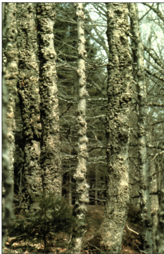
Affected trees with lesions in the Aftermath Forest.

Salvage dead or declining trees with thin crowns and yellowish foliage. These trees are often invaded by secondary decay fungi that can degrade wood within 2 to 3 years. Remove trees with sunken lesions or large patches of dead wood — these trees are likely to have defects. Consider retaining some large trees to provide wildlife habitat.