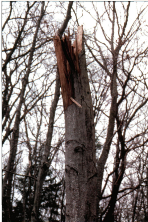
An example of beech snap.

superficial. Trees with raised lesions or blocky bark (indicating that Nectria was walled off) had little or no wood defect. Most defects were removed with the bark slab at the sawmill. Sunken lesions could cause defects over time, usually because of bark inclusions buried in wood. Defects associated with sunken bark lesions generally affected lumber grade rather than volume. Trees that were heavily infested by scale and had large patches of dead bark had extensive wood defects or, more typically, died.