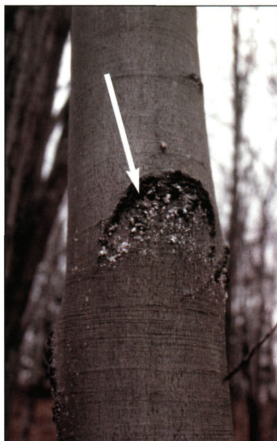
Beech scales first become established on rough areas of the bark, such as old branch stubs.

Symptoms of scale infestation: Crawlers prefer to colonize areas of the tree where the bark is rough. Newly infested trees usually have the first small spots or patches of “white wool” on the trunk around areas of rough bark. Infestations often start near old branch stubs, under large branches, or sometimes beneath mosses or certain lichens. As the scale population builds, the entire trunk and large branches of the tree may be covered with white wool.