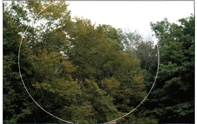
Foliage of infected trees appears yellowish.

Trees dying from Nectria infection usually have a distinct appearance when viewed from a distance. Leaves that emerge in spring do not mature and crowns appear thin or ragged. Leaves remain on the trees but become yellowish later in the summer.