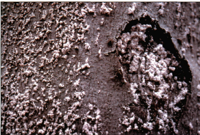
Beech bark scales secrete a white waxy covering that looks like wool.

Life cycle: Beech scale has one generation per year. Adults lay pale yellow eggs on the bark in midsummer, then die. Eggs are attached end-to-end in strings of four to seven eggs. Eggs hatch from late summer until early winter. The immature scales that hatch from eggs are called crawlers or nymphs. Unlike adults, crawlers have functional antennae