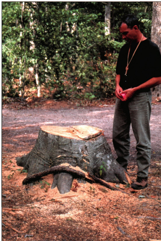
Dead or dying hazard trees in a camping area may require removal.

When high-value ornamental or yard trees are of concern, some protection from beech bark disease is possible by controlling the beech scale. Note that this is not a one-time treatment. This exotic insect is now a permanent resident of our forests. Continued protection is necessary to prevent scales from reinfesting trees and creating the wounds that allow invasion of the Nectria fungi.