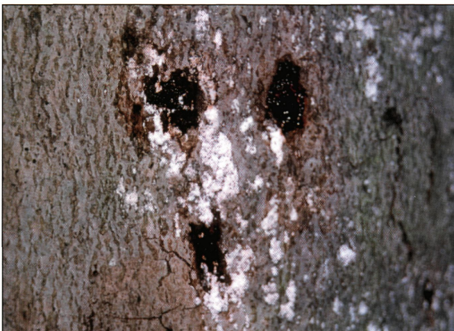
Tarry spots can indicate Nectria infection.

Typically only the bark and inner bark are killed by the Nectria fungi, but occasionally dead areas may extend into the sapwood when the cankers are infected by other fungi. The Nectria fungi may infect localized areas on the tree, causing linear strips of bark to die along the tree trunk or branches. If larger or more numerous areas are infected, the tree may be girdled and killed. If the fungus invades only narrow strips of bark on vigorous trees, callus tissue often forms and the bark becomes rough. Sometimes the tree is able to wall off these cankers if they are small. If beech scale numbers are high, however, Nectria often spreads or coalesces rapidly and is not likely to be restricted by callus formation. Scales cannot survive on tissue that has been killed by the fungus. A strip of scale-free bark running down an otherwise infested tree often indicates where bark has died.