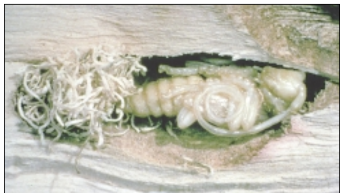
An Asian longhorned beetle pupa.