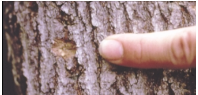
An adult beetle lays a single white egg in each oviposition pit.

Adult beetles are usually active from May to October, with peak activity occurring in midsummer. After mating, a female adult chews a round or oval pit through the outer bark and into the cambium area between the bark and the wood. She then deposits an egg under the bark at the bottom of the pit. Adult beetles live for several weeks, and each female can lay from 25 to 40 eggs during her lifetime. The eggs hatch within 1 to 2 weeks, and the young larvae feed in the cambium area, just under the bark. Older larvae tunnel deeper and feed in the wood. Larvae periodically push coarse sawdust and fecal particles out of their galleries. The larvae spend the winter in the wood. They pupate in late spring or early summer, and the new adults emerge from the tree in early to midsummer. The large adults each leave a round hole in the tree where they emerge. The young adults will feed on the bark of twigs and small branches before mating. The Asian longhorned beetle generally has one generation per year, although some beetles require two years to complete their development.