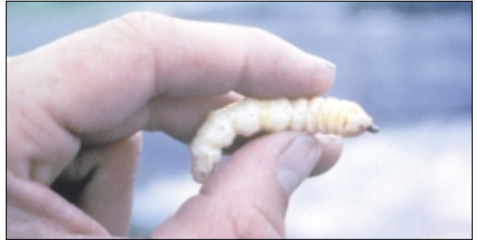
Larvae are white or yellowish grubs that may reach a length of 1½ to 2 inches.