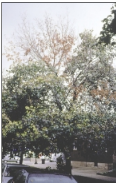
The branches in the upper canopy of this tree are infested with Asian longhorned beetles and are dying.

Horsechestnut, poplar, box elder and willow trees were also infested. Asian longhorned beetles will attack live, apparently healthy trees, young and old trees, stressed trees, and recently cut trees, logs or stumps. To date, the two known infestations of Asian longhorned beetles in North America have