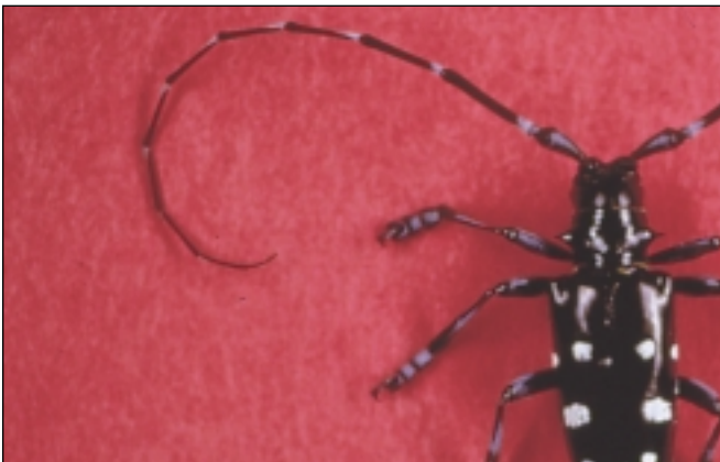
Adult Asian longhorned beetles are large, active black beetles with white markings. Their antennae are long with black and white bands.