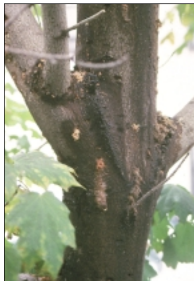
Sawdust and sap staining an infested maple tree.

When an adult Asian longhorned beetle completes its development and emerges from a tree, it leaves a round hole about ⅜ inch in diameter. These round holes can be found anywhere on the tree, including branches, the trunk or large exposed roots. Piles of coarse, sawdust-like frass may be found in the crotch where a branch meets the main stem or at the