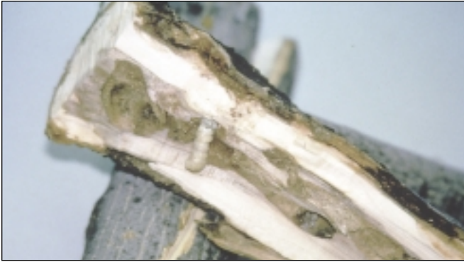
Larvae feed in tunnels (galleries) in the wood of the branches, stems and roots.