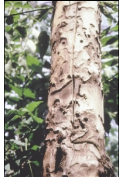
A box elder tree that was heavily infested by Asian longhorned beetles. The bark was removed to show the larval galleries.

Branches and trees with high numbers of galleries are also likely to break in strong winds. Feeding by adult beetles on twigs and small branches can cause some small twigs to die. These small wounds and the pits chewed out by egg-laying females could also lead to infection by tree diseases.