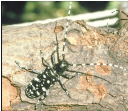
Asian longhorned beetle.

The Asian longhorned beetle is native to China, Korea and Japan. Therefore, entomologists expect this beetle to be able to tolerate a wide range of weather conditions in North America. It could probably survive at latitudes ranging from that of Cancun, Mexico, to Milwaukee, Wis. 1