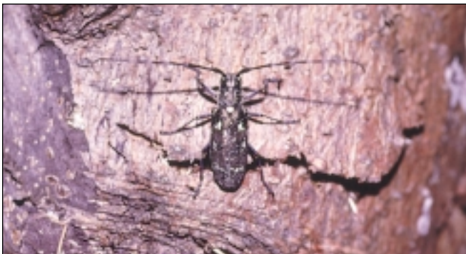
Many native species of wood-boring beetles also occur in North America. This white-spotted sawyer is common in conifer forests.

Yes! There are many species of longhorned beetles in North America. These native beetles also feed in tunnels in the sapwood of many kinds of hardwood and conifer trees. Pine sawyer, for example, is a common beetle found in most pine forests in Michigan. Other native species include the sugar maple borer, the locust borer and the poplar borer. Entomologists can help you distinguish between native wood-boring beetles and the Asian longhorned beetle.