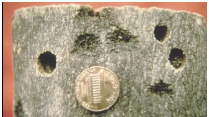
Two oviposition (egg-laying) pits (above the penny) and round exit holes where adult beetles emerged.