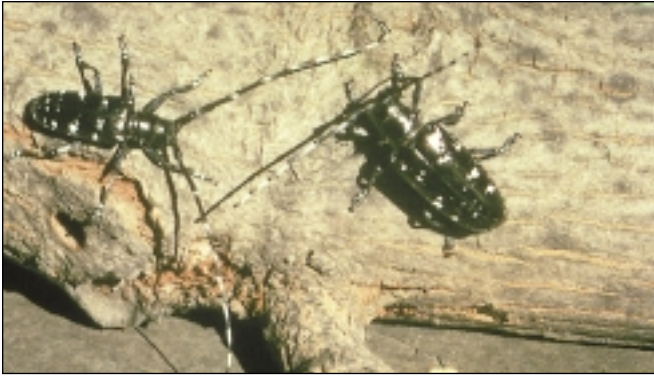
Female Asian longhorned beetles (right) are larger than male beetles (left).