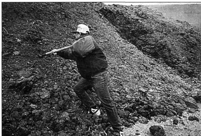
Taking litter sample for pathogen and nutrient analyses.

Deep stacking is an anaerobic fermentation process; composting is an aerobic fermentation process. In the deep stacking method, the litter is piled 6 to 8 feet high and packed. Caution: If heavy tractors are used for packing, the pile of litter may not heat up to 130 degrees F. Under suitable conditions, the pile will generate heat in 3 to 5 days. The minimum temperature needed to destroy pathogens is 130 degrees F. Temperatures over 150 degrees F, however, may reduce the nutritive value of the litter. In addition to temperature, ammonia generated by the breakdown of urea during storage and lactic acid produced during fermentation may also destroy pathogenic organisms. After the initial heat, the stack may be covered with a 6 mil plastic sheet to prevent weather-related problems and runoff. Used tires may be placed on the stack to anchor the plastic cover.