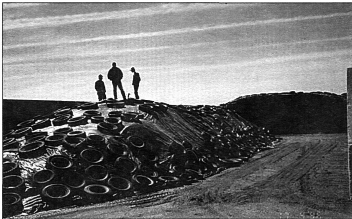
Pile is covered with plastic after the initial heating (one week).