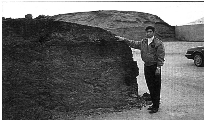
Deep stacked turkey litter pile that has not been covered. Half of stack has already been fed to cattle. It is important that DSTL is removed from one end only.