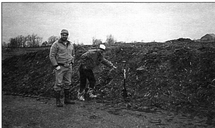
Taking pile temperature using probe, three to five days after stacking.