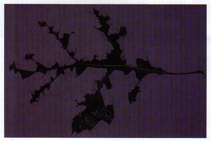
Figure 4. Orange-striped oakworm caterpillars consume nearly all the foliage on oak leaves, leaving only the main veins of the leaves intact. Note the eggs on the leaf that have already hatched.

Residents living in areas experiencing orange-striped oakworm outbreaks do have options for protecting shade and ornamental trees and reducing the nuisance that orange-striped oakworm caterpillars can cause. Some residents may choose to do nothing and allow natural enemies to eventually control the orange-striped oakworm population. On small oak trees, you may wish