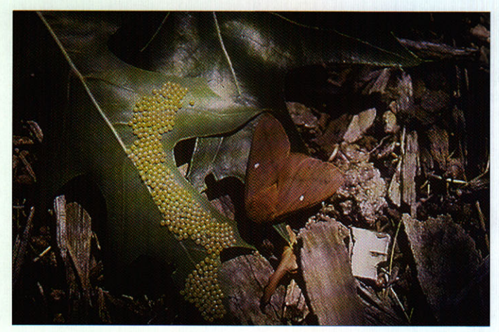
Figure 3. An orange-striped oakworm adult moth and the eggs that she just laid on an oak leaf.

The good news about the orange-striped oakworm and other fall defoliators is that their feeding rarely affects tree health. By late summer, when orange-striped oakworm caterpillars begin feeding, trees have completed most of their photosynthesis and are preparing for winter dormancy. Therefore, defoliation in late summer is less stressful to trees than defoliation earlier in the summer caused by other pests such as forest tent caterpillar and gypsy moth.