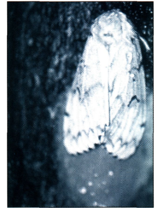
Female gypsy moth and egg mass

Nope — gypsy moth is here to stay and is now a part of Michigan's forest and urban forest ecosystems. But you can help keep gypsy moth from spreading into new areas that are not yet infested. Gypsy moth females like to lay their egg masses in dark, protected locations such as the undersides of lawn chairs or picnic tables or on firewood. Egg masses may also be found on recreational vehicles or trailers or in the wheel wells of cars.