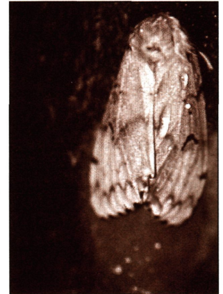
Female gypsy moth and egg mass

Nope — gypsy moth is here to stay and is now a part of Michigan's forest and urban forest ecosystems. But you can help keep gypsy moth from spreading into new areas that are not yet infested. Gypsy moth females like to lay their egg masses in dark, protected locations such as the undersides of lawn chairs or picnic tables or on firewood. Egg masses may also be found on recreational vehicles or trailers or in the wheel wells of cars.