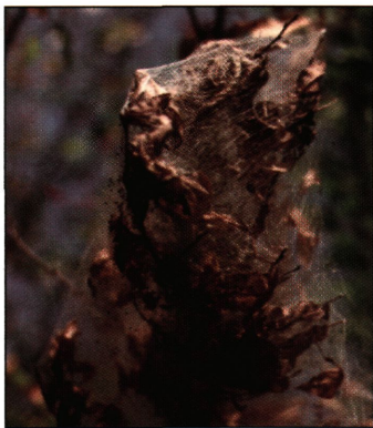
Loosely webbed foliage