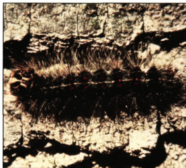
Gypsy moth caterpillar

Many Michigan residents have heard of the gypsy moth, though they may not know what the insect looks like. Gypsy moth is a notorious pest that feeds on the leaves of oaks, aspen and many other species of shade and forest trees. It was accidentally introduced into Massachusetts in 1869 and has since been spreading across the northeastern United States and into the north central states. The first gypsy moth outbreaks in Michigan occurred in the mid-1980s in the central Lower Peninsula. Since then, most areas of lower Michigan have experienced an outbreak.