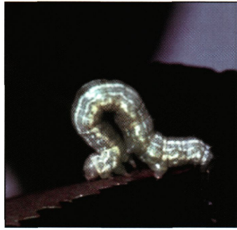
A spring cankerworm "inches" along.