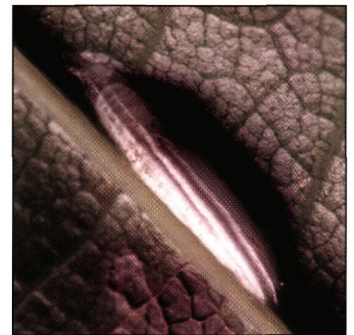
(L) Pupal case and feeding damage; (R) close-up view of pupal case