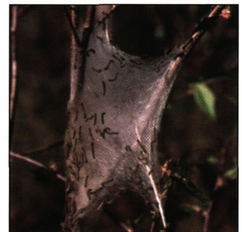
(L) Caterpillars; (R) silk tent in a cherry tree

The caterpillar is dark brown or black with a pale yellow stripe running the length of its body, and it may grow to be nearly 2 inches long. Eastern tent caterpillars feed on wild cherry, apple and crabapple trees but do not feed on oak trees. These caterpillars construct the silken tents that are often seen in cherry trees along the roadside in spring. Tents are constructed in twig and branch crotches and do not enclose leaves. Defoliation usually ends by mid- to late June. Trees seldom suffer serious damage, though the tents are unattractive. Cuckoos often feed on these caterpillars.