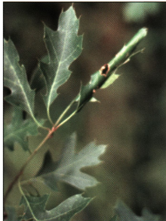
Note rolled leaf.

These insects feed on white oak and other oak species. Caterpillars fold or roll individual leaves together, forming shelters where they feed and rest. Caterpillars are greenish with dark heads and may be up to 1 1/4 inches long. Damaged leaves may appear skeletonized or shredded. Egg and pupal parasitoids help control these insects.