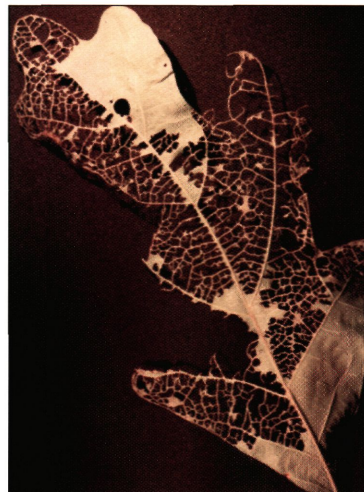
Skeletonized oak leaf

Caterpillars are small (1/4 inch long) and yellowish green. There are two generations a year; caterpillars are usually present in June and again in August. Young caterpillars feed in tiny leaf mines. Older caterpillars feed on the soft tissue on the undersides of oak leaves but leave the upper surfaces intact. This kind of feeding gives the leaves a "skeletonized" appearance.