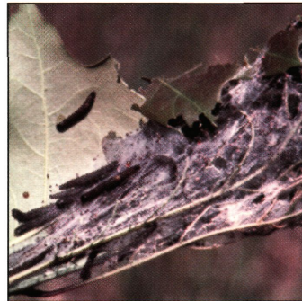
Ugly nest caterpillar