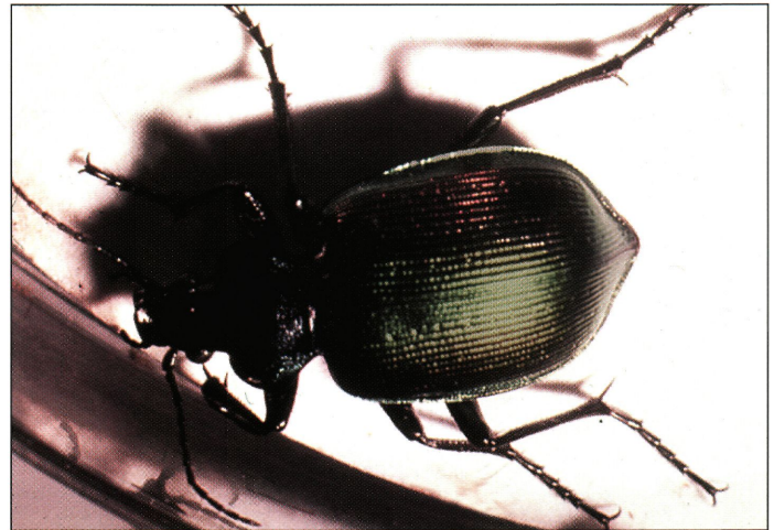
Figure 1. Adult C. sycophanta .

and active predation. C. sycophanta is one of the largest and most brilliantly colored carabids. Adults are metallic green and dark blue and may reach sizes of 25 mm or more (Fig. 1). Immature beetles are strikingly different. Dark brown larvae attain lengths of 35 mm and have long, slender abdomens (Fig. 2).