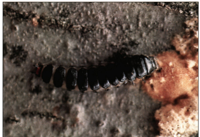
Figure 2. Immature C. sycophanta .