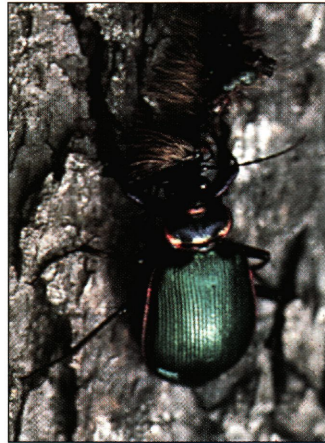
Figure 3. Predation on gypsy moth larva.

Though C. sycophanta is a good predator of gypsy moth, it is not likely to harm populations of native moth or butterfly species. Beetles are active only during the weeks when large gypsy moth caterpillars are likely to be present. Also, female beetles must feed extensively within a week after they emerge from the soil or their eggs will not mature. This means that high numbers of C. sycophanta are produced only when gypsy moth caterpillars are abundant.