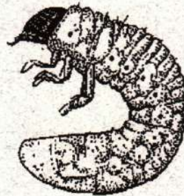
Another type of white grub

Insect parasitic nematodes have been effective for control of billbug larvae when applied in late June or early July. Apply the nematodes as a spray in early morning or evening. Irrigate the turf with 1/2 inch of water before the nematodes are applied and apply another 1/2 inch of water afterward.