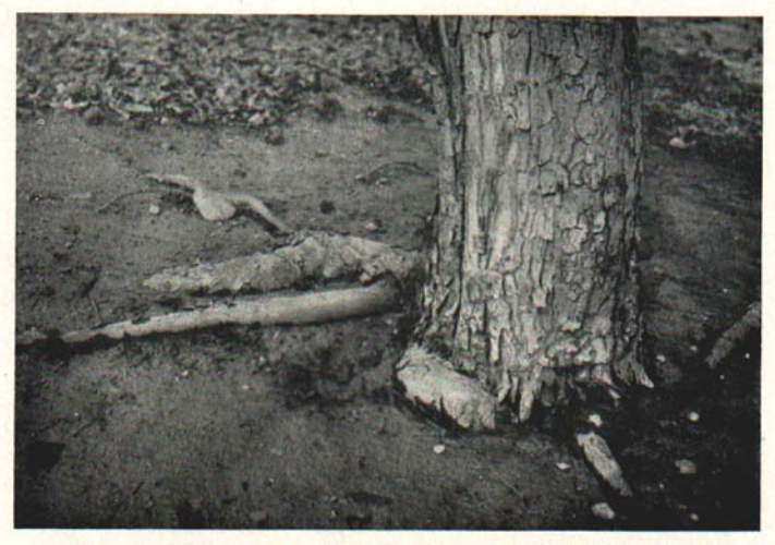
Fig. 3. Baldwin tree grown on cultivation-cover crop plot, illustrating extent of soil loss by erosion. Such exposed roots are subject to injury by cultural equipment and are subject to winter injury.

fruit usually has better color and finish than when the variety is produced in cultivated orchards.