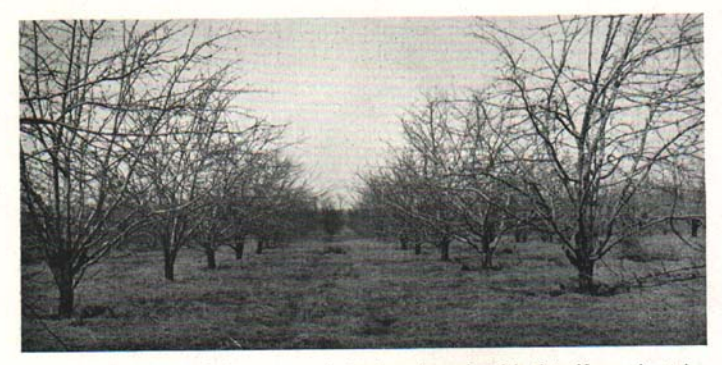
Fig. 4. Character of the cover maintained on the sod-mulch plot. No erosion takes place here and the roots are sheltered from winter freezes by the mulch and grass.

Red clover is more vigorous and grows taller than those already mentioned and is usually found on the more fertile soils such as those which support a good growth of Kentucky bluegrass