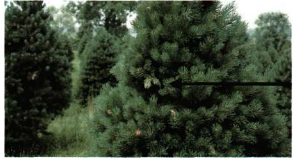
Figure 3. Damaged shoots on Scotch Pine.

Generally, the reproduction phase of this beetle in pine stumps and slash causes little economic damage.