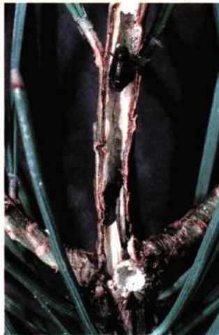
Figure 2. Mined shoots of Scotch Pine. (Arrow indicates entrance gallery)

Adults use host volatiles such as alpha-pinene to locate suitable host material for breeding. T. piniperda does not appear to produce an aggregation