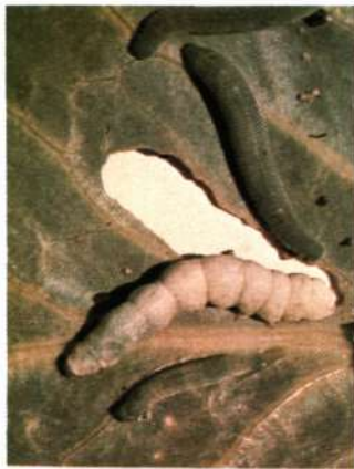
1. Cabbage looper (light green) and imported cabbageworm (dark green)

For safe and effective use of insecticides, always identify the problem correctly.