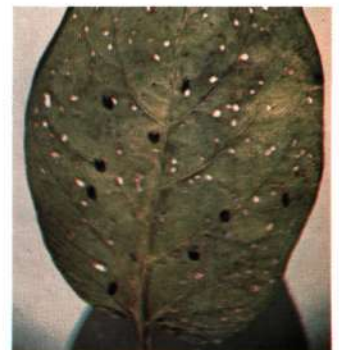
12. Potato flea beetle and damage