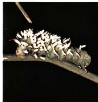
3. Hornworm showing cocoons of parasite on back