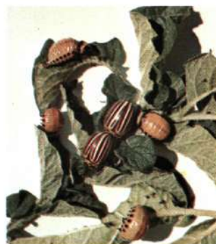
11. Colorado potato beetle larvae and adults