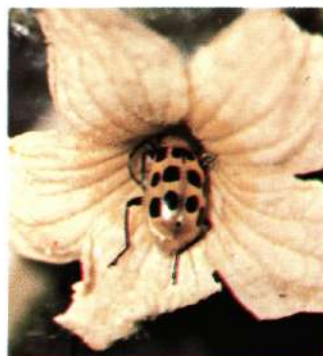
10. Spotted cucumber beetle