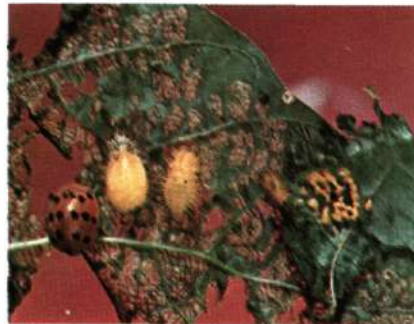
6. Mexican bean beetle adult, pupa, larvae, eggs, and damage