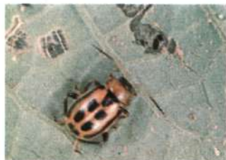
5. Bean leaf beetle