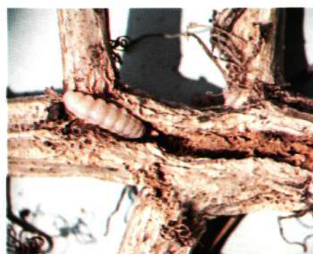
14. Squash vine borer and damage