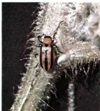
9. Striped cucumber beetle