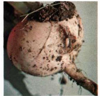
8. Root maggot and damage