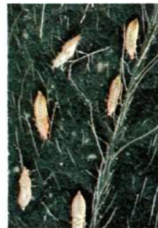
7. Thrips (enlarged)