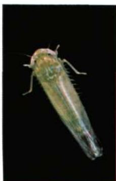
13. Potato leafhopper (greatly enlarged) and leafhopper damage