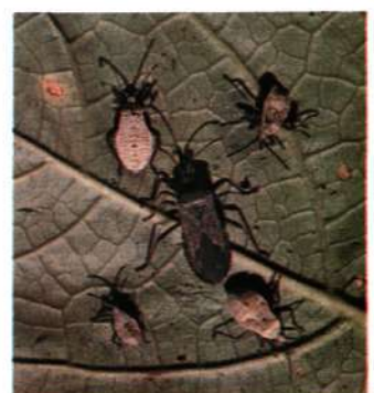
15. Squash bug nymphs and adult