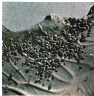
2. Cabbage aphid. Other species damage many crops.