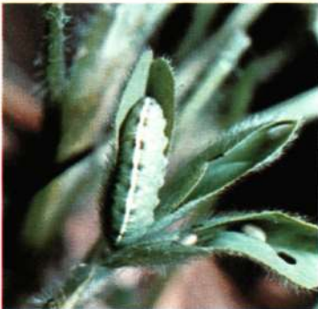
2. Clover leaf weevil larva