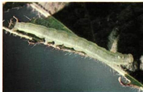
6. Green clover worm