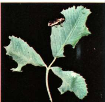
3. Sweet clover weevil and typical damage