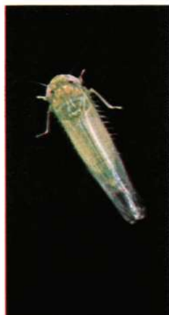
7. Potato leafhopper (greatly enlarged) and leafhopper damage to alfalfa