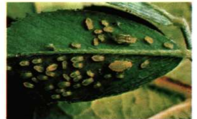
9. Spotted alfalfa aphid