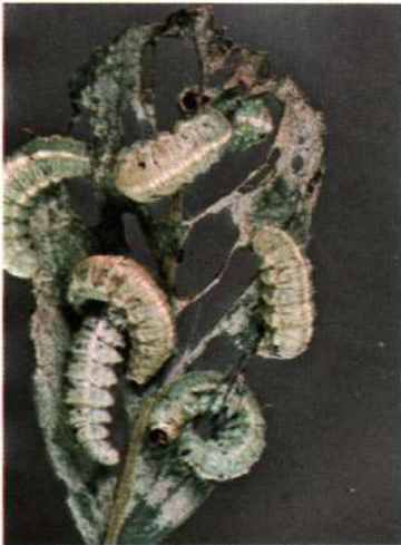
1. Alfalfa weevil adult, and larvae and damage