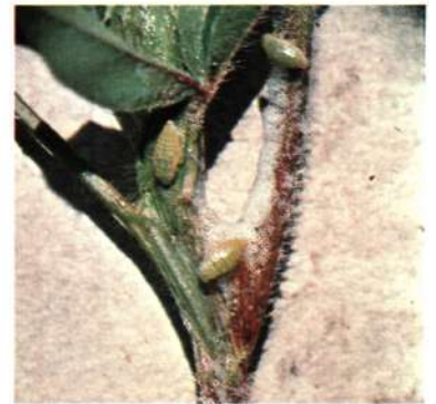
8. Meadow spittlebug and nymphs