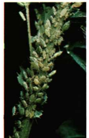
10. Pea aphid