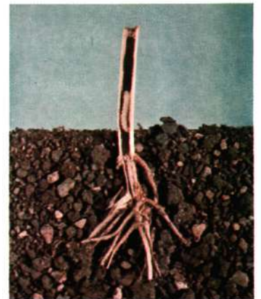
9. Wheat stem sawfly