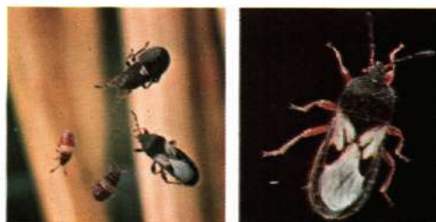
7. Chinch bug nymphs and adult, and adult greatly enlarged