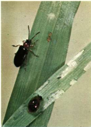
1. Cereal leaf beetle adult, eggs, larva, and damage

For safe and effective use of insecticides, always identify the problem correctly.