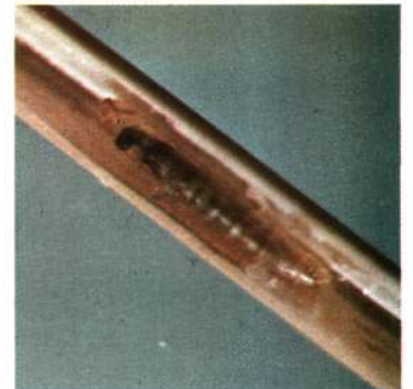
8. Wheat stem maggot