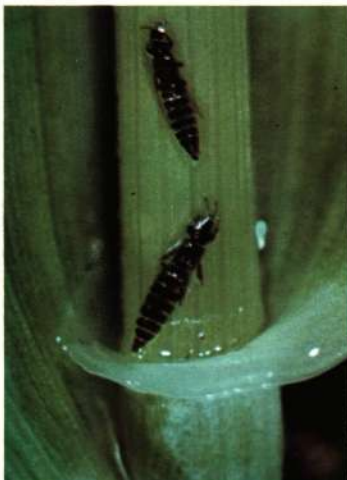
3. Thrips (greatly enlarged)