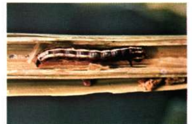
10. Common stalk borer