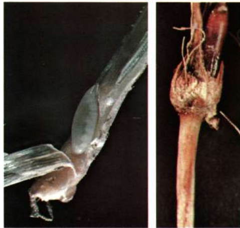
4. Hessian fly larva, and puparium showing location behind lower leaf sheaths