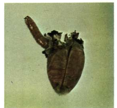
11. Wireworm and damage to seed