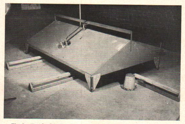
Fig. 1. For the first few days one end of the feeders are placed under the brooder.

For the first few days the feeders should be placed under the brooder, or food may be sprinkled on papers or on paper plates under the brooder. Place the feeders toward the center of the brooder, like spokes in a wheel (as shown in Fig. 1). When all the chicks have learned to eat, the equipment may be gradually moved out (Fig. 2).