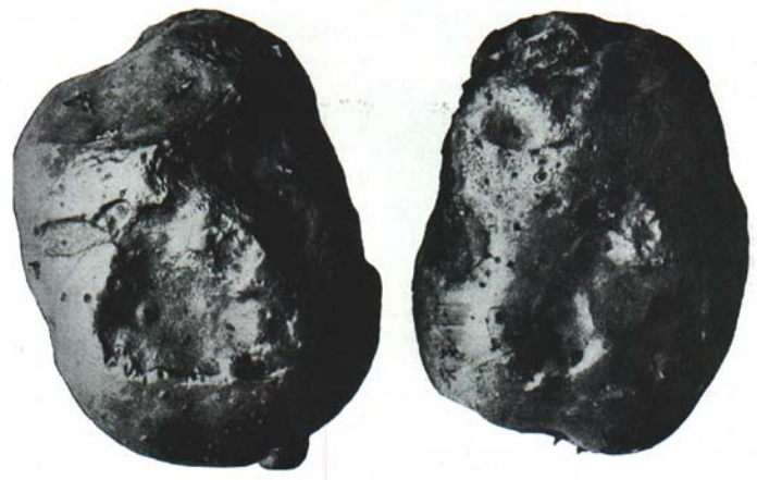
Fig. 2. Sunken areas on tubers indicate late blight rot.

On the tuber late blight first appears as a small purplish or brownish discoloration of the skin (Fig. 2). Later, the flesh beneath this spot