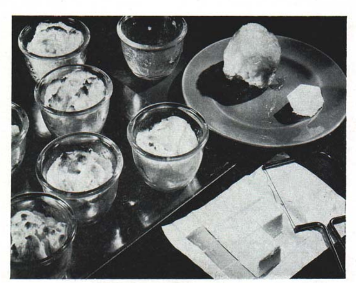
Fig. 1. Orange rolls served with cheese