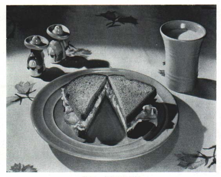
Fig. 2. Amber sandwich