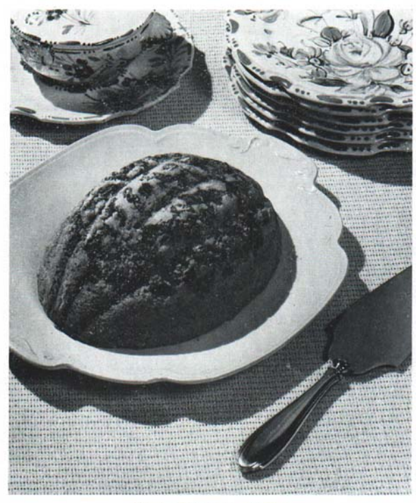
Fig. 5. Honey bran pudding