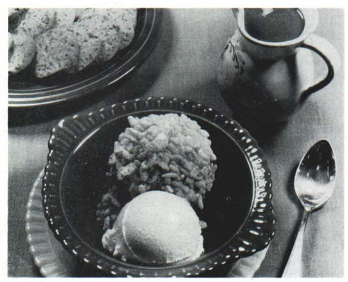
Fig. 4. Honey ice cream with rice krispies

Pour warmed honey over servings of ice cream. Sprinkle with rice krispies or other crisp cereals.