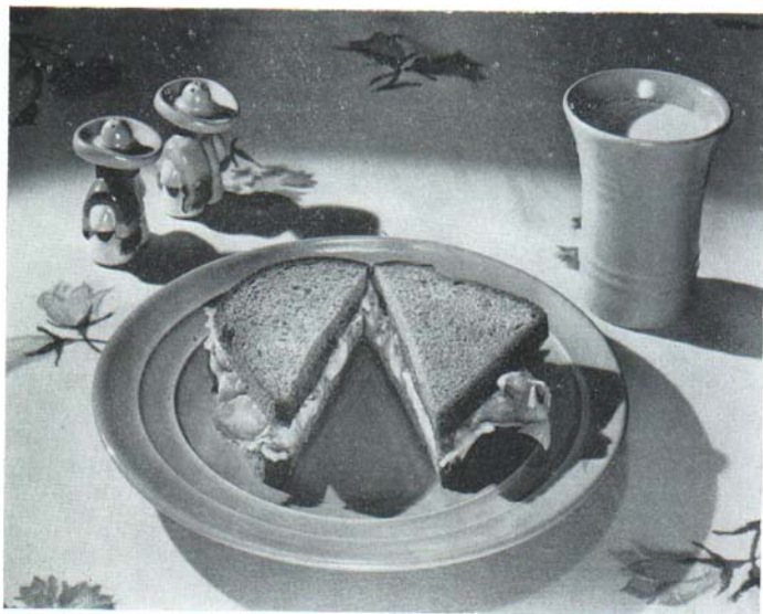
Fig. 2. Amber sandwich