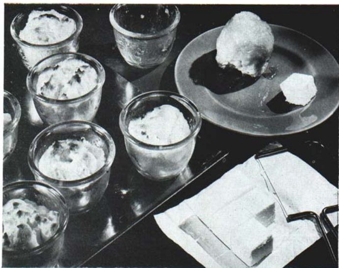
Fig. 1. Orange rolls served with cheese