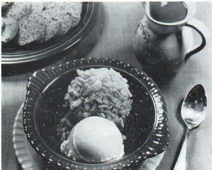
Fig. 4. Honey ice cream with rice krispies

Pour warmed honey over servings of ice cream. Sprinkle with rice krispies or other crisp cereals.