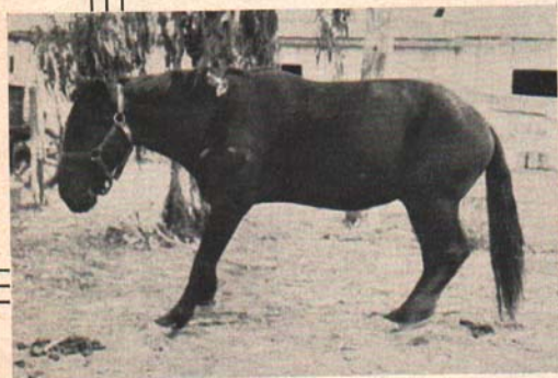
A Typical Case

MICHIGAN STATE COLLEGE EXTENSION DIVISION EAST LANSING