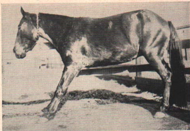
Fig. 2. Backing stance—typical symptoms of dizziness.

The present trend is toward an increase in the incidence of sleeping sickness in the United States as a whole, but the disease is by no means a devastating plague. Conservative estimates place the number of horses and mules that contract and develop the disease in affected territories at one in ten. The latest Federal data relating to the situation in the whole country show that 21.4 per cent of the sick horses and mules died. Viewed from the mortality standpoint, therefore, about 2 per cent of the horses and mules have died of the disease in the affected areas. Most of such losses can be prevented by proper procedures.