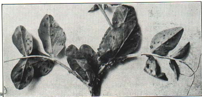
Fig. 3. Pea vines showing the effect of pea-aphid.