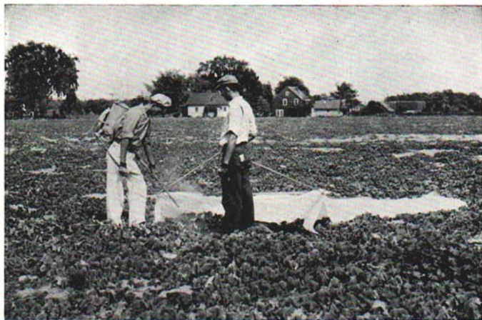
Fig. 2. Dusting cucumbers for aphids with hand duster and light cloth trailer.

Many growers hesitate to use power machinery on cucumbers and melons for fear of injury to the vines. There is no reason why vines