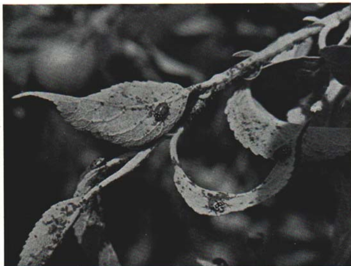
Fig. 5. Ladybird beetles feeding upon aphids.

It is with this thought in mind that a few illustrations of beneficial insects and their work are inserted.