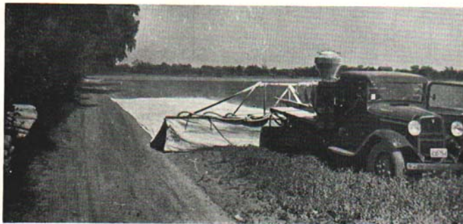
Fig. 4. Duster equipped with trailer in pea field.

dry with rains of the heavy, dashing kind; then, parasitic diseases and insects start work almost as soon as the plant lice, and the plant lice never have a chance to become plentiful.