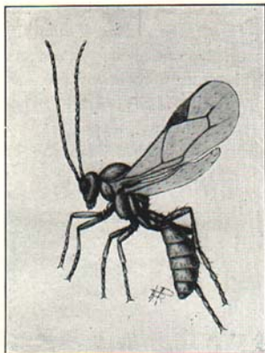
Fig. 8. Lysiphlebus , a wasplike parasite of aphid (greatly enlarged) which lays eggs in the bodies of aphids.