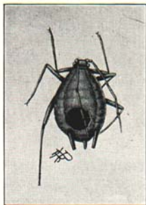
Fig. 7. An aphid from which Lysiphlebus has emerged (greatly enlarged).