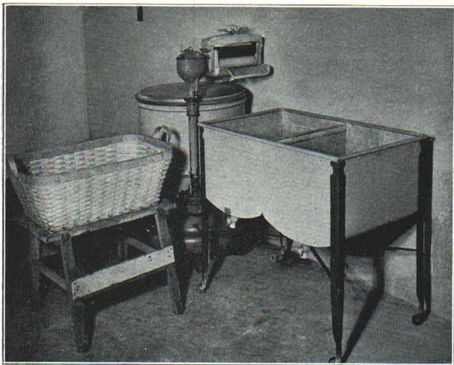
Fig. 1. Equipment for washing including machine, wringer, two portable tubs, basket and stand. Note the drains on the tubs and the wall outlet for attaching the machine. Running water would add to the efficiency of this arrangement.

The electrically driven washing machine is the simplest to operate of all types. Most of them are equipped with one-quarter horse power motors which will operate on three kilowatt hours of electricity to do 10 hours of washing. This is approximately one month's operation.