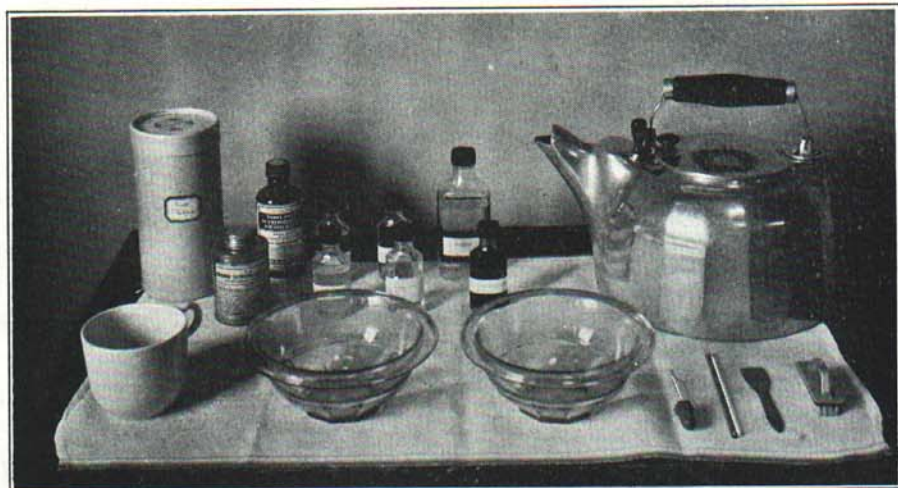
Fig. 4. Supplies and equipment for stain removal include: hot water, soap, solvents, bleaches, bowls, medicine dropper, glass rod, small spatula, brush, and pads of cloth.

The solvents commonly used to dissolve stains are clear water, soapsuds, carbon tetrachloride or other non-inflammable dry cleaning solutions, turpentine, kerosene and acetone. The stains are dissolved either by dipping the article in the solvent or by placing a pad of cloth under the spot and sponging with the solvent from the wrong side of the material.