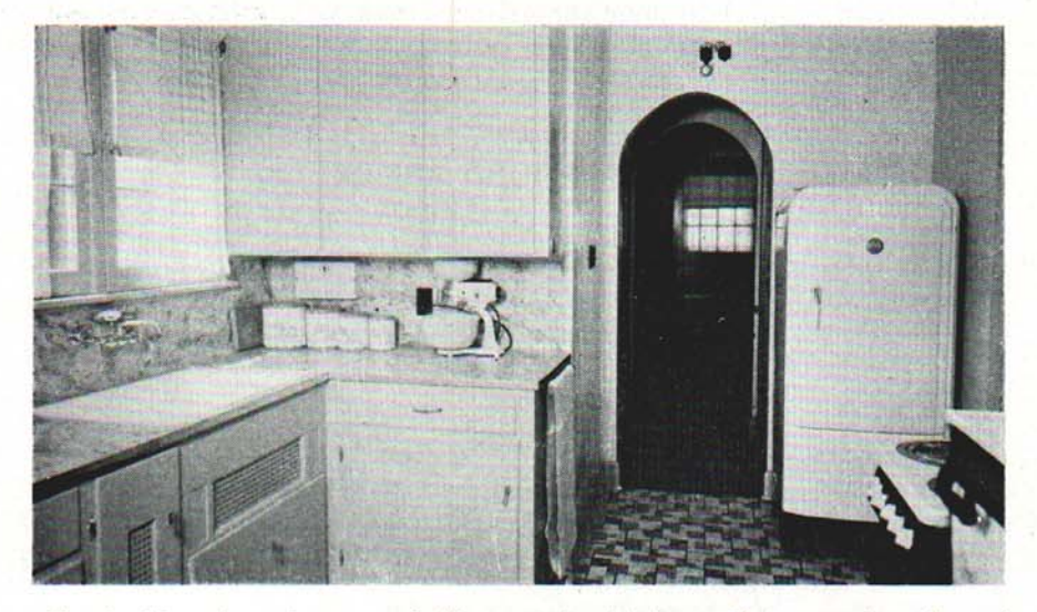
Fig. 1. Note these features of this attractive kitchen: Plain smooth walls and woodwork, simple inconspicuous hinges and latches; floor covering with appropriate pattern, tailored curtains of sheer material, linoleum work surface with mottled design and color interest in towels and cannister set.

When the floor covering contains a variety of colors it can be used as a guide in selecting the other colors for the room. Particularly suited in both pattern and color is a marbleized or mottled design which contains medium values and intensities of blues, greens, ivory and reds. That permits freedom in choice of other colors for the room. For example, the walls and woodwork for a room with this floor covering