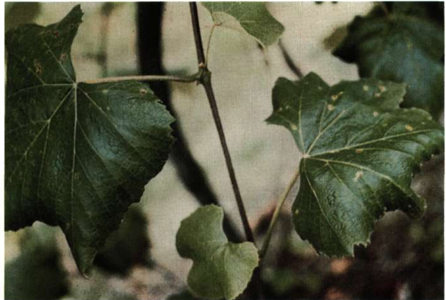
Fig. 10. Leaf symptoms of Phomopsis leaf and cane spot disease appear as small angular dead spots.

Leaf symptoms of powdery mildew appear in early to mid-July as a white