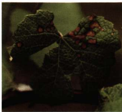
Fig. 1. Black rot lesions on leaf. Note dark borders of spots.

Mid-season infection of green fruit is evidenced by a whitish circular spot 1/8 inch in diameter on the fruit at the point of infection. About two weeks later, after the fungus has grown throughout the berry, it begins to shrivel and look like a hard bluish raisin (Fig. 2). These eventually fall to the