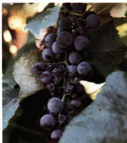
Fig. 2. Black rotted grapes shrivel in the cluster and resemble blue raisins.

ground and are an inoculum source for the rest of the season. American varieties such as Concord and Niagara are quite susceptible to the pathogen; Delaware and certain French-American hybrids are moderately resistant. Aurore is a particularly susceptible variety. (See Table 1).