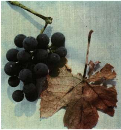
Fig. 11. Elongated dark lesions of Phomopsis on cluster stem and along leaf veins.