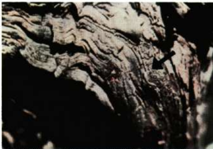
Fig. 8. "Stroma" of the Eutypa fungus. Note the pimple-like perithecia (arrow) containing ascospores which are ejected from autumn to May.