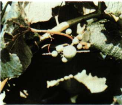
Fig. 17. Berry cluster shelling occurs on vines that have been infected with peach rosette mosaic virus for several years. Note small fruit cluster.