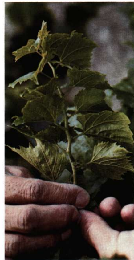
Fig. 19. Abnormally shortened internodes of tomato ringspot or tobacco ringspot virus infected grapevines.

Concord and Catawba and Niagara grapevines are infected with peach rosette mosaic virus (PRMV) in a large percentage of vineyards in Michigan. This virus is soil-borne and is spread from plant to plant by the root-feeding