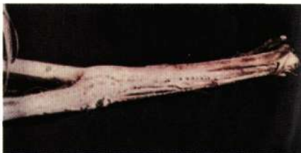
Fig. 9. Fruiting bodies of the Phomopsis fungus on an infected cane.

nation of fungicides that will control both black rot and downy mildew. Consult the MSU Fruit Spraying Calendar (Extension Bulletin E-154) for fungicide rates.