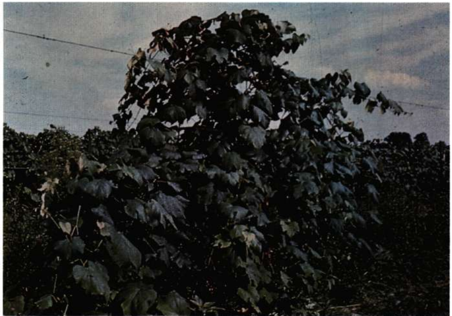
Fig. 14. Peach rosette mosaic virus infected vines are often umbrella-shaped.