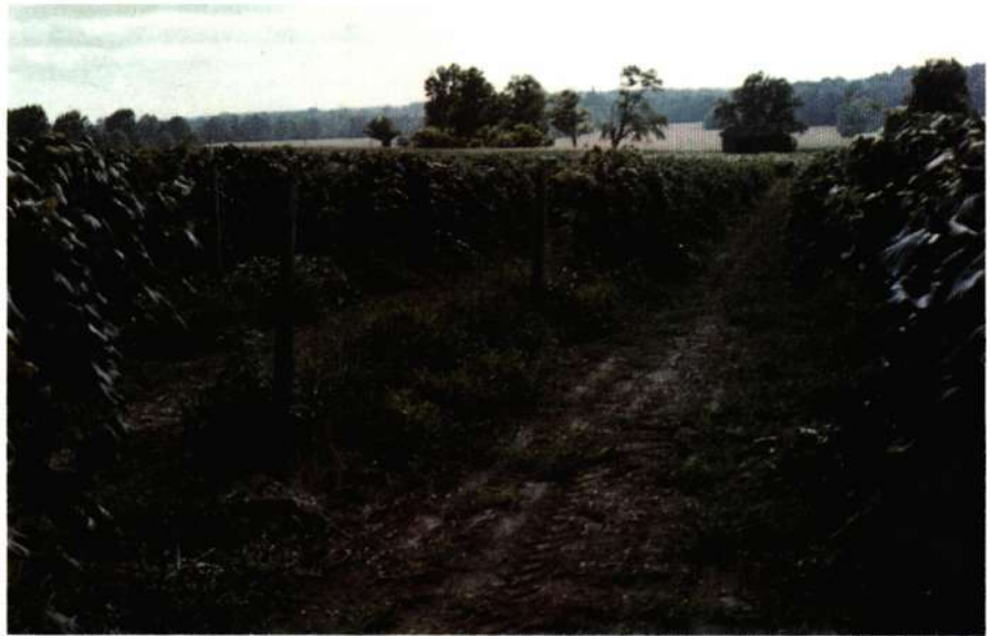
Fig. 13. Missing vines indicate an infection center for peach rosette mosaic virus. Dead vines have been removed.

Removal and burning of diseased arms or the entire vine is recommended. Sometimes a new vine can be trained from a sucker. However, these often show disease symptoms after a few years. Double-trunking has also been successfully done. If one trunk becomes diseased, it can be cut off leaving the other which may remain disease-free for some time.