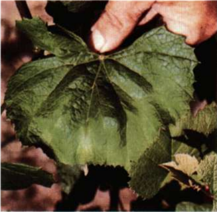
Fig. 16. Distorted leaf of peach rosette mosaic virus-infected vine.