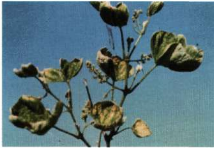
Fig. 7. Symptoms of Eutypa dieback include stunted shoots and yellowed leaves cupped upward.