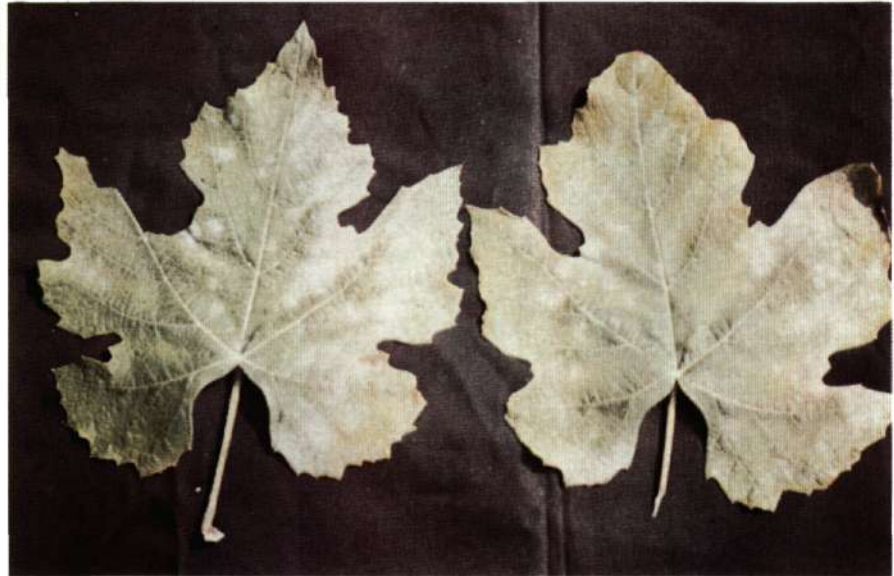
Fig. 6. The powdery mildew fungus causes white, webby patches on leaves and other green parts of the vine.