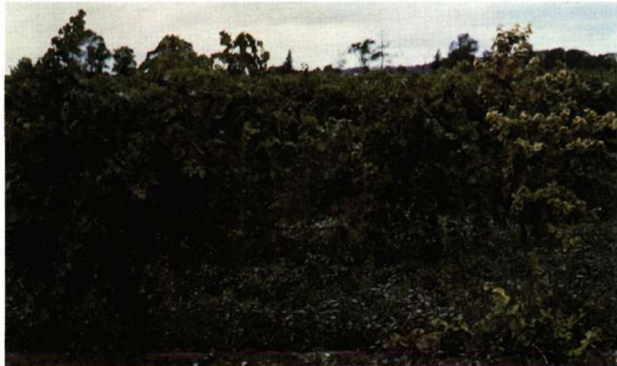
Fig. 18. Tomato ringspot or tobacco ringspot virus infection causes yellow stunted leaves and shoots. (Healthy vine on left and diseased on right.)

Fungicide sprays applied at the 1-inch shoot length stage, again at the 4- to 6-inch shoot length stage (first black rot spray) once during bloom and again at pea size will give good control. For specific fungicides and rates, consult the MSU Fruit Pesticide Handbook (ExtensionBulletin E-154).