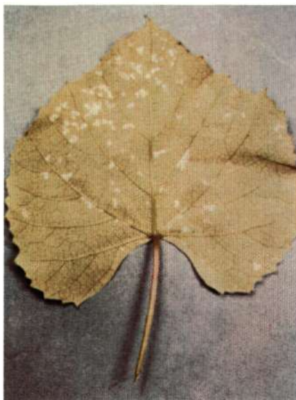
Fig. 4 (top) & 5 (bottom). Yellow areas on upper leaf surface correspond with white mycelial patches of the downy mildew fungus on the lower leaf surface.