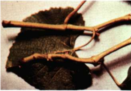
Fig. 15. Shortened cane internodes caused by peach rosette mosaic virus.