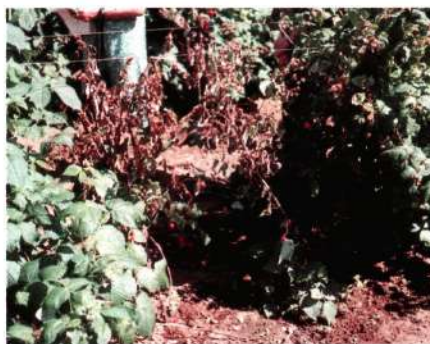
Figure 11. Phytophthora root rot can cause entire canes to wilt and die in mid-summer.

Botrytis ( Botrytis cinerea ) or Grey mold symptoms on ripening fruit appear as a grey, fuzzy mold on the fruit surface. Penicillium rot ( Penicillium sp.) consists of whitish areas on the