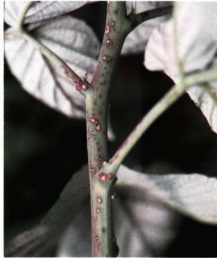
Figure 5a. Gray spots with purple borders will occur on canes infected with Anthracnose.

Black and purple raspberry varieties are most seriously affected by anthracnose ( Elsinoe veneta ), but the disease can be economically significant on red varieties also. Symptoms appear on canes, leaves, and sometimes on the fruit. Infected canes show tiny purple