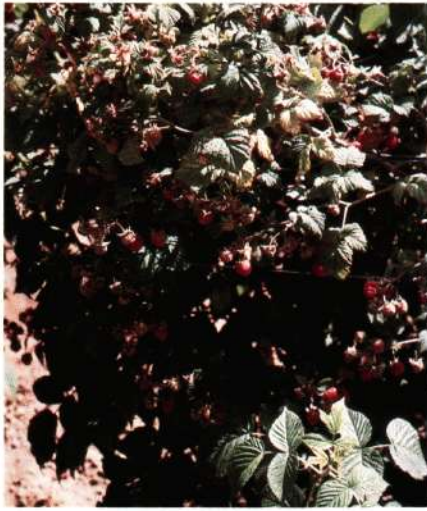
Figure 4. Tomato ringspot virus infection causes plant stunting and general yellowing of leaves.

has a very wide range of hosts, including many weeds such as dandelion, curly dock, plantain and chickweed. The virus is spread by the dagger nematode Xiphinema americanum from the roots of diseased raspberry bushes or weeds to the roots of healthy bushes.