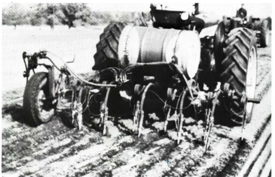
Figure 10. Injection of soil fumigant using a shank-type applicator.