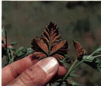
Figure 8. Orange rust pustules on back of late leaf rust infected leaf.

Orange rust ( Kunkelia nitens ) attacks black and purple raspberries, but not red varieties. Leaf symptoms develop toward the end of June. Infected leaves are small and yellowish with orange pustules of waxy rust spores on the underside of the leaves (Fig. 7). The spores are shed and cause new infections over a 2- to 3-week period. Leaf symptoms disappear from the field by mid- to late summer. The fungus invades all parts of the plant (including the roots).