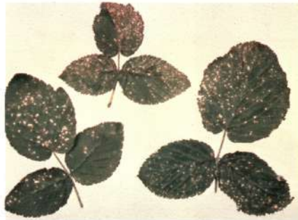
Figure 5b. Shot-hole appearance of leaves infected with anthracnose.

spots which progress to light grey round spots about 1/8 inch in diameter. The spots enlarge to about 1/4 inch, have ash-grey centers and may have purple borders (Fig. 5A). As the canes age, the spots appear sunken and the borders raised. Leaves will develop similar small round spots or lesions about 1/16 inch in diameter (Fig. 5B). Diseased tissue frequently drops out leaving a "shot-hole" appearance. If the disease is not controlled, canes become cracked and the drupelets of the berries become infected, resulting in worthless fruit. The fungus survives the winter in infected