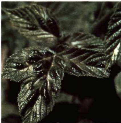
Figure 1b. Blistering of leaves as well as mosaic pattern can occur with raspberry mosaic virus.

This virus is widespread throughout the Michigan fruit growing area. It causes disease in stone fruits (peaches, plums, cherries, etc.), pome fruits (apples, pears, etc.), blueberries and grapes. Symptoms in raspberries are not very strong. A few leaves on infected bushes may show some pale ringspots in the spring, but these later disappear. The main effect is a general