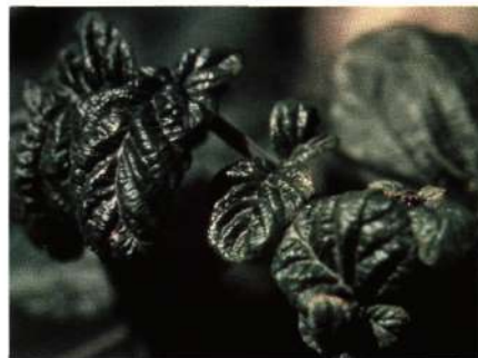
Figure 2. Leaves are rounded, curl downward and dark green in color with raspberry leaf curl virus infection.

stunting of the bush, a general yellowing of leaves (Fig. 4) and production of small, crumbly fruit. Virtually all raspberry varieties are susceptible. Tomato ringspot virus