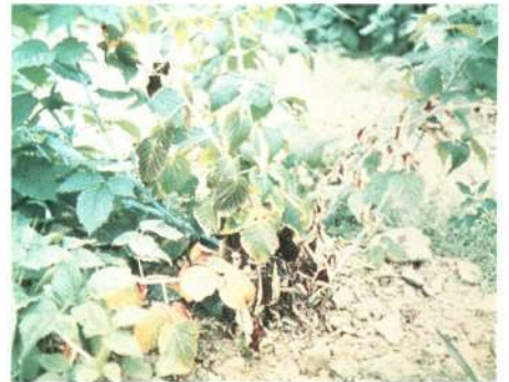
Figure 9. Leaf yellowing and blue stems are the symptoms of Verticillium wilt.

Verticillium wilt ( Verticillium albo-atrum ) of raspberries is caused by a soil borne fungus. The fungus penetrates