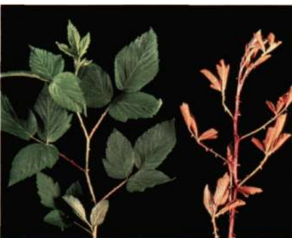
Figure 7. Small, yellow infected leaves with orange spore pustules are typical symptoms of orange rust.

Control: Never prune during wet weather. To prevent infection, canes should remain dry for at least 3 days after pruning so wounds will callus. Prune out and burn infected canes in the spring.