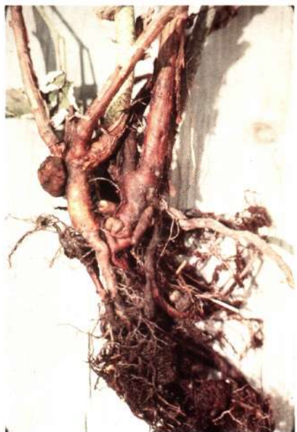
Figure 12. Galls on crown and roots of crown gall infected plant.

The bacteria of crown and cane gall ( Agrobacterium spp.) cause galls on roots (Fig. 12) or on canes. Infected bushes become weakened, stunted or unproductive as a result of the gall tissue interfering with water and nutrient