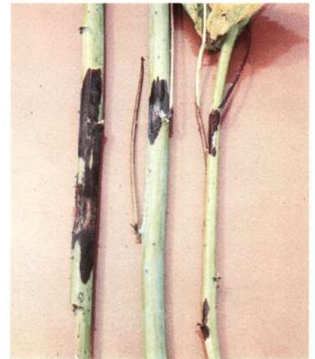
Figures 6a. Brownish purple cane lesions of spur blight start at a spur but can extend up or down the cane.

Spur blight ( Didymella applanata ), is a serious disease of red raspberry varieties. Infected canes release ascospores and conidia in May and June during rainy periods. Conidia release contin-