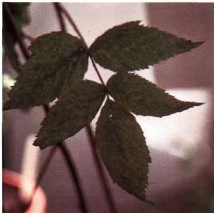
Figure 1a. Mottling of leaves is a typical symptom of raspberry mosaic virus infection.

This is the most widespread and damaging raspberry virus. All commonly grown cultivars can be infected by the mosaic virus, except for Canby, which is resistant. Mosaic symptoms consist of light green to dark green or yellow to green mottling of the leaves on infected canes (Fig. 1A); blistering of leaves as well as a mosaic pattern are also evident (Fig. 1B). The plants show a progressive stunting of growth and poor yield. Fruits on infected bushes are small and crumbly. The common raspberry aphid (a rather large, greenish aphid found on shoot tips and on the under-