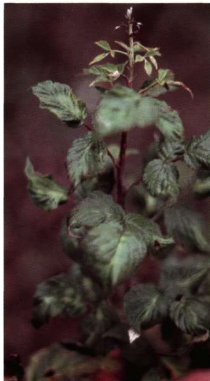
Figure 3. Deformed leaves blotched with yellow are symptoms of tobacco streak virus infection.