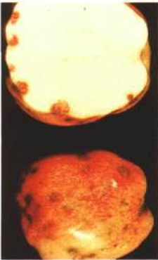
3. Bitter pit or Jonathan spot