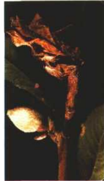
8. Brown rot