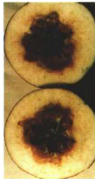
14. Brown heart or core