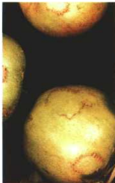
12. Leaf pucker