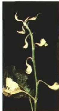
13. 2,4-D injury