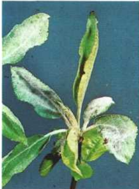
4. Powdery mildew