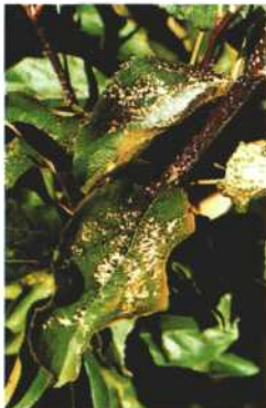
9. Apple mosaic