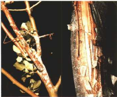
1. Papery bark canker