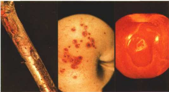
2. Botryosphaeria (Bot) rot