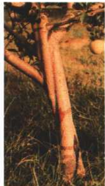
10. Trunk twisting and flattening