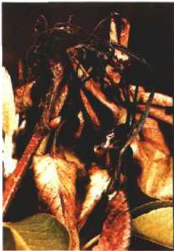
7. Fire blight