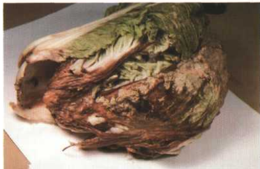
27. ROT: Disintegration, discoloration, and decomposition of plant tissue. A dry or hard rot if the decay is firm and dry; or a wet rot if soft, watery and foul smelling. Soft rot of lettuce and blossom end rot in tomato.