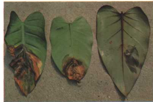
17. HYDROSIS (water soaking): A water-soaked appearance caused by the movement of water from cells into spaces between the cells; a common symptom during early stages of many bacterial diseases. X. dieffenbachia on dieffenbachia.