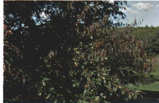
11. DIEBACK: Progressive death of branches or shoots beginning at the tips and moving toward the main stem or trunk. Usually associated with woody plants. Fireblight on crabapple.