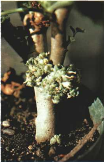
13. PROLIFERATION: Excessive development of secondary roots or stems around a main root or stem. Marked dwarfing may be associated with shortened internodes of stems. Fasciation of geranium.