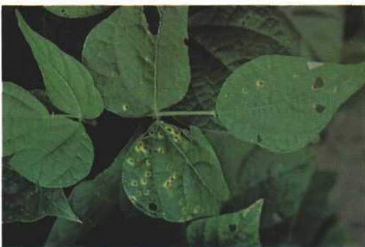
15. HALO: A spot on a leaf surrounded by a discolored (usually yellow) circle. Bean rust.