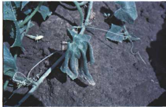
34. WILTING: Loss of freshness and rigidity, and drooping of plants due to insufficient water in the plant. Cucumber wilt.

COVER: Apple scab caused by venturia inaequalis .