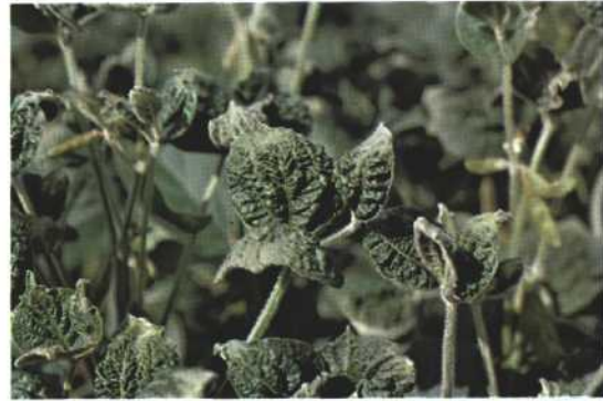
28. RUGOSITY: Wrinkling, ridging or puckering of normally flat leaves. Virus symptoms on soybean.