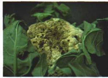
22. NECROSIS: Dead tissue or plant parts. Alternaria on cauliflower. Downy mildew on cabbage.