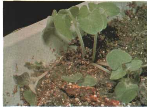
10. DAMPING OFF (Post-emergence): Rapid rotting of the stems of seedlings at the soil line or the rotting of the root system after their vegetative growth above-ground is established. Damping off of impatiens.