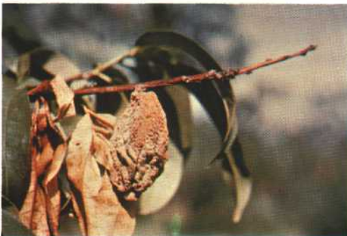
21. MUMMIFICATION: Darkening, wrinkling, hardening of rotted fruit. Results from a rapid loss of moisture from the fruit. Brown rot of peach.