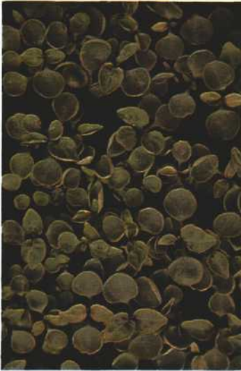
07. CUPPING: Up- or down-ward curling of the entire leaf margin forming a cup- or bowl-like shape. Gas injury to begonia.