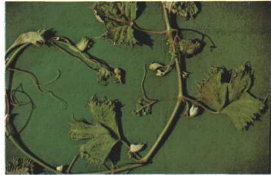
16. HERBICIDE INJURY: Gross leaf distortion. 2, 4-D injury on grape.