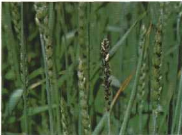
32. SMUT: A disease caused by smut fungi and characterized by masses of brown to black powdery spores. Loose smut in wheat, corn smut.