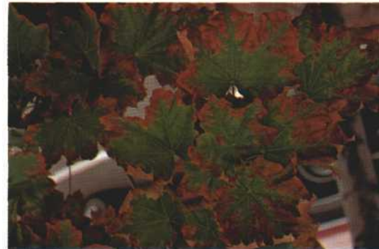
23. MARGINAL NECROSIS (scorch): Burning or dying and browning of leaf margins. Usually results from unfavorable environmental conditions. Scorch symptoms on maple.