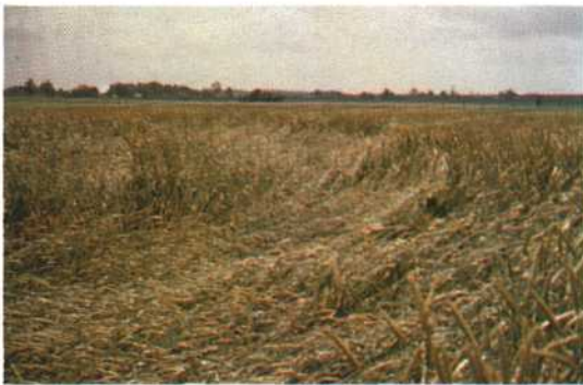
20. LODGING: Falling over of plants at the base, usually associated with root rots. Wind damage on wheat.