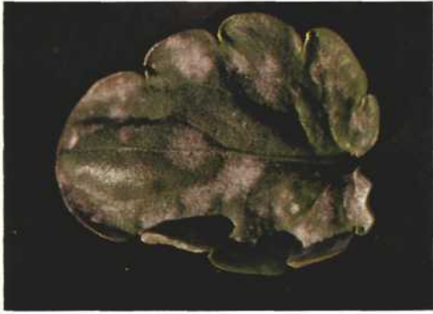
25. POWDERY MILDEW: Whitish growth on plant surfaces, usually the leaf or stem. Cotton-like in appearance, initially occurs in spots. Powdery mildew on pansy.