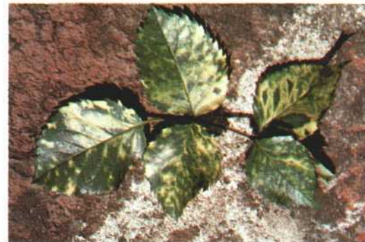
24. MOSAIC: Variegated patterns of shades of greens and yellows in normally green leaves. Also characterized by intermingled patches of normal and light green or yellowish color. A common symptom of many viruses. Rose Mosaic Virus.