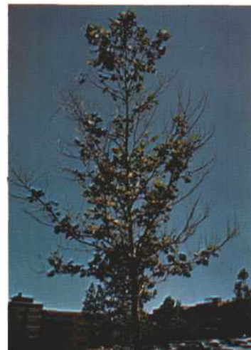
18. LEAF OR NEEDLE DROP: An untimely and uncommonly large loss of needles or leaves. Anthracnose on sycamore.