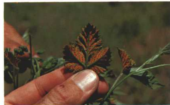
30. RUST: A disease giving a "rusty" appearance to a plant and characterized by dense masses of reddish-brown to orange spots on leaves and other plant parts. Orange rust on brambles.