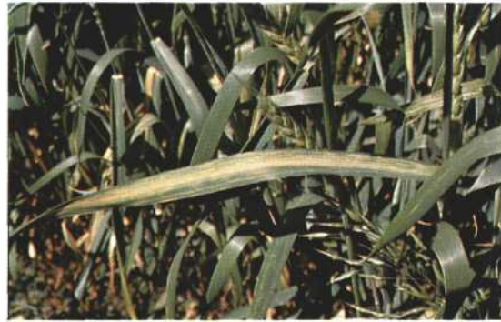
33. STREAK (stripe): Narrow, elongate areas on leaves characterized by yellowing or necrosis of the affected area. Wheat streak virus on wheat.