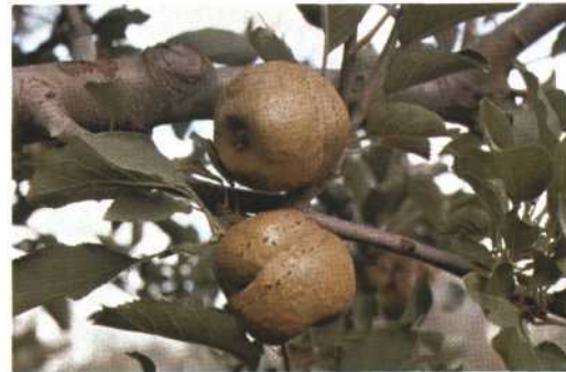
29. RUSSETTING: Brownish roughened areas on the skin of a fruit or tuber as a result of cork formation. Russett of Golden Delicious apple.