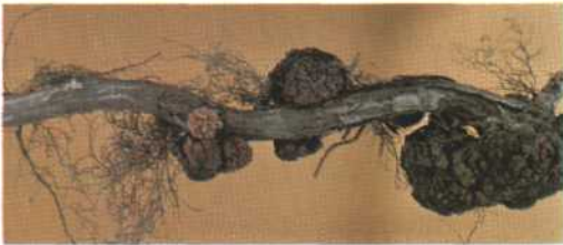
14. GALL: A more or less spherical overgrowth or swelling of unorganized plant cells, usually the result of attack by insects, bacteria, fungi, or nematodes. Root crown gall on euonymus, stem crown gall in rose.