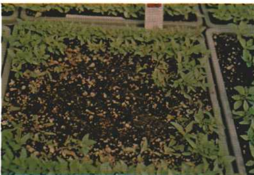
09. DAMPING OFF (Pre-emergence): A rapid rotting of the base of the stems or seedlings after germination but before the seedling breaks the soil surface. Damping off of impatiens.