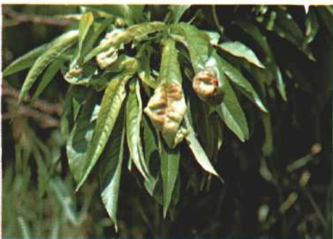
08. CURLING: Abnormal bending of leaves from the unequal development of its two sides. Peach leaf curl.