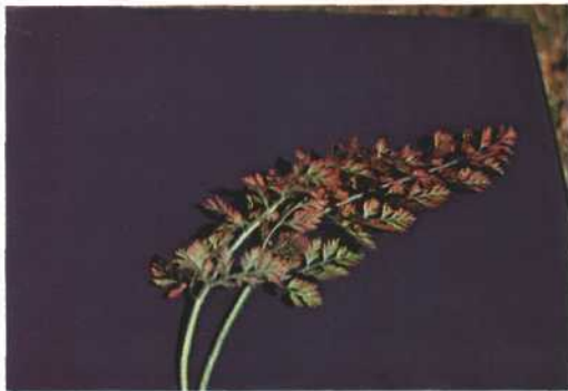
26. REDDENING (purpling): Reddish or purplish discoloration of leaves or other organs which are normally green. May be a localized or general symptom. Aster yellows on carrot.