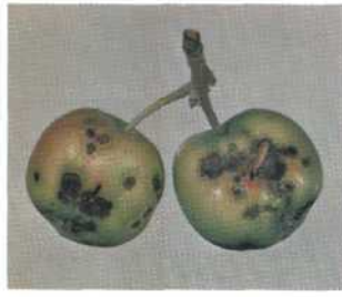
31. SCAB: A roughened, crust-like diseased area on the surface of a plant organ. Potato scab, apple scab.