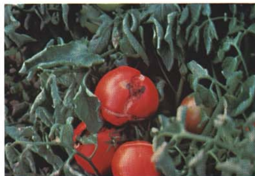
06. CRACKING: Splitting of tissue usually associated with drying cells. May result from different growth rates in adjoining tissue. Tomato crack.