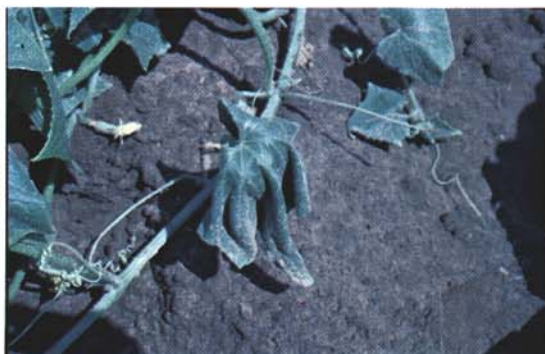
34. WILTING: Loss of freshness and rigidity, and drooping of plants due to insufficient water in the plant. Cucumber wilt.

COVER: Apple scab caused by venturia inaequalis .