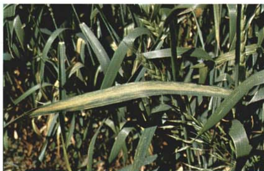
33. STREAK (stripe): Narrow, elongate areas on leaves characterized by yellowing or necrosis of the affected area. Wheat streak virus on wheat.