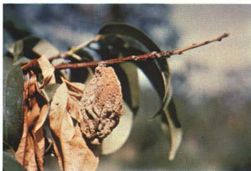
21. MUMMIFICATION: Darkening, wrinkling, hardening of rotted fruit. Results from a rapid loss of moisture from the fruit. Brown rot of peach.