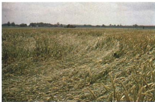
20. LODGING: Falling over of plants at the base, usually associated with root rots. Wind damage on wheat.