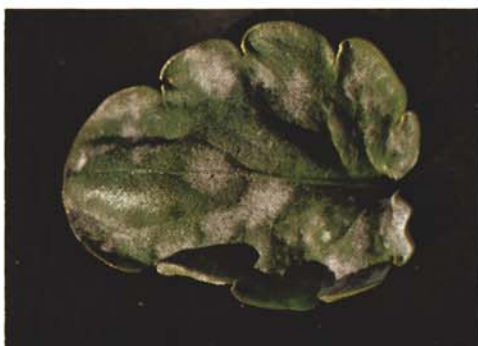
25. POWDERY MILDEW: Whitish growth on plant surfaces, usually the leaf or stem. Cotton-like in appearance, initially occurs in spots. Powdery mildew on pansy.