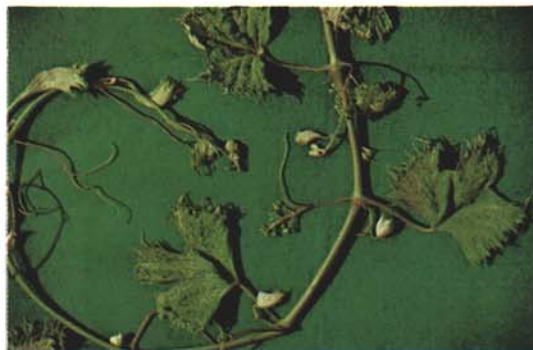
16. HERBICIDE INJURY: Gross leaf distortion. 2, 4-D injury on grape.