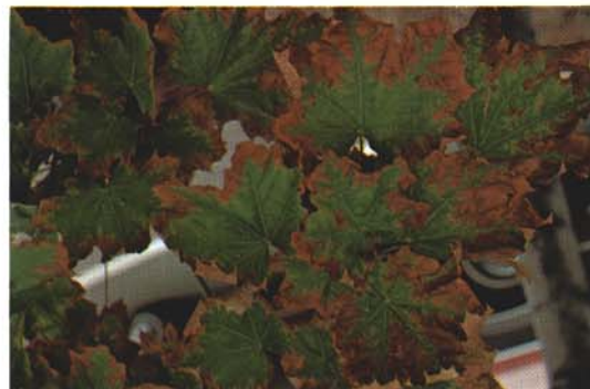
23. MARGINAL NECROSIS (scorch): Burning or dying and browning of leaf margins. Usually results from unfavorable environmental conditions. Scorch symptoms on maple.