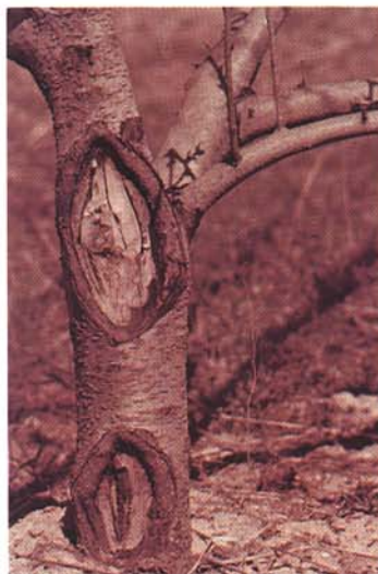
04. CANKER: Necrotic (blackened), often sunken spot on a root, stem, branch, or twig of a plant. Usually sharply defined with the margins associated with callus tissue. Bacterial canker on cherry.