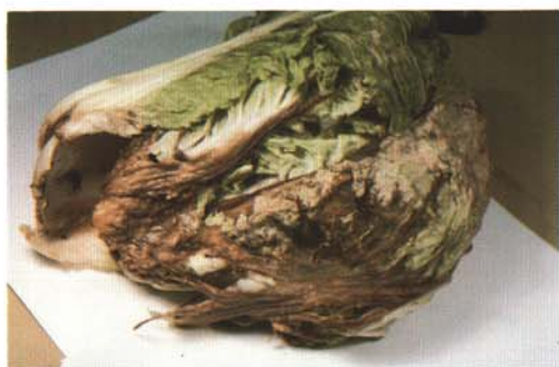
27. ROT: Disintegration, discoloration, and decomposition of plant tissue. A dry or hard rot if the decay is firm and dry; or a wet rot if soft, watery and foul smelling. Soft rot of lettuce and blossom end rot in tomato.