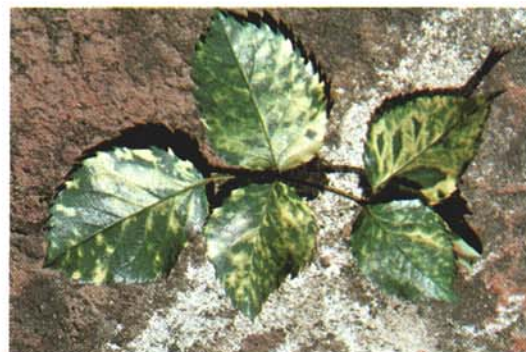
24. MOSAIC: Variegated patterns of shades of greens and yellows in normally green leaves. Also characterized by intermingled patches of normal and light green or yellowish color. A common symptom of many viruses. Rose Mosaic Virus.