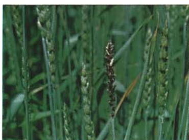
32. SMUT: A disease caused by smut fungi and characterized by masses of brown to black powdery spores. Loose smut in wheat, corn smut.