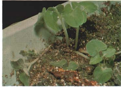
10. DAMPING OFF (Post-emergence): Rapid rotting of the stems of seedlings at the soil line or the rotting of the root system after their vegetative growth above-ground is established. Damping off of impatiens.