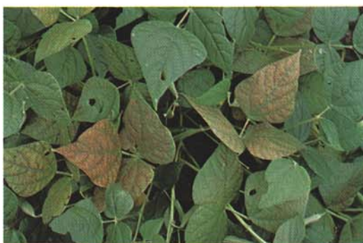
02. BRONZING: Copper or bronze color in leaves or needles. Air pollution injury on beans caused by ozone.