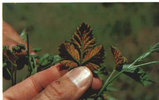
30. RUST: A disease giving a "rusty" appearance to a plant and characterized by dense masses of reddish-brown to orange spots on leaves and other plant parts. Orange rust on brambles.