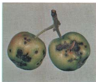
31. SCAB: A roughened, crust-like diseased area on the surface of a plant organ. Potato scab, apple scab.