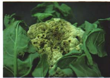
22. NECROSIS: Dead tissue or plant parts. Alternaria on cauliflower. Downy mildew on cabbage.