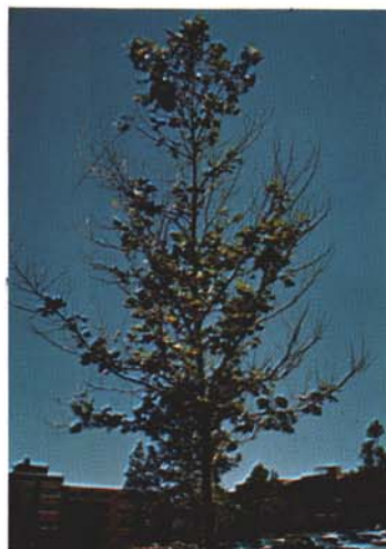
18. LEAF OR NEEDLE DROP: An untimely and uncommonly large loss of needles or leaves. Anthracnose on sycamore.