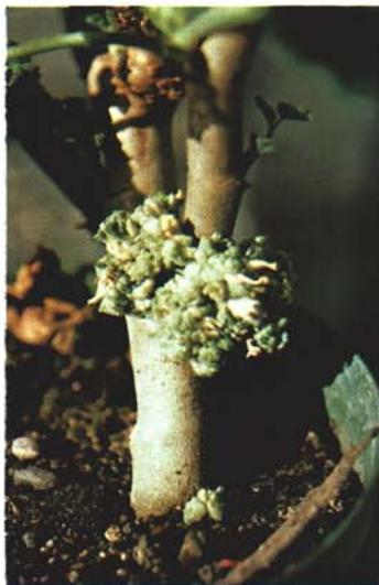
13. PROLIFERATION: Excessive development of secondary roots or stems around a main root or stem. Marked dwarfing may be associated with shortened internodes of stems. Fasciation of geranium.