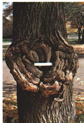
03. CALLUS: Tissue overgrowth around a wound canker. Develops from actively dividing plant cells. Nectria canker on maple.