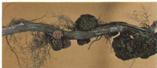
14. GALL: A more or less spherical overgrowth or swelling of unorganized plant cells, usually the result of attack by insects, bacteria, fungi, or nematodes. Root crown gall on euonymus, stem crown gall in rose.