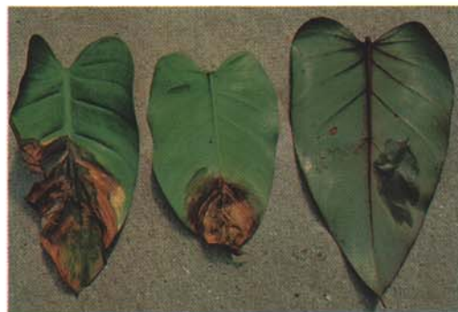
17. HYDROSIS (water soaking): A water-soaked appearance caused by the movement of water from cells into spaces between the cells; a common symptom during early stages of many bacterial diseases. X. dieffenbachia on dieffenbachia.