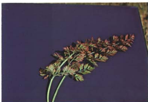
26. REDDENING (purpling): Reddish or purplish discoloration of leaves or other organs which are normally green. May be a localized or general symptom. Aster yellows on carrot.