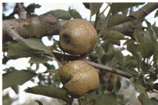
29. RUSSETTING: Brownish roughened areas on the skin of a fruit or tuber as a result of cork formation. Russett of Golden Delicious apple.