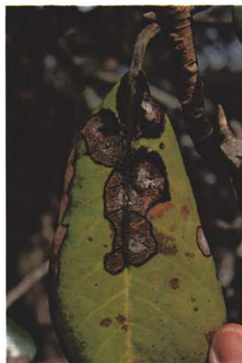
01. BLOTCH: Large and irregular-shaped spots or patches on leaves, stems and shoots. Algal leaf spot on magnolia.