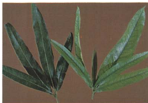
05. CHLOROSIS (yellowing): Yellowing of normally green tissues due to the destruction of the chlorophyll or the partial failure of the chlorophyll to develop. Iron chlorosis on shingle oak (right). Normal leaf on left.