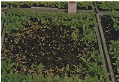
09. DAMPING OFF (Pre-emergence): A rapid rotting of the base of the stems or seedlings after germination but before the seedling breaks the soil surface. Damping off of impatiens.