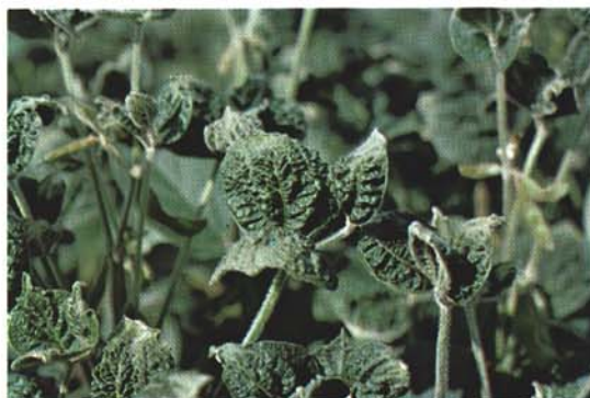
28. RUGOSITY: Wrinkling, ridging or puckering of normally flat leaves. Virus symptoms on soybean.