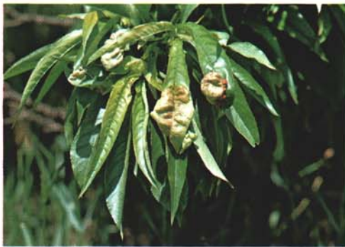
08. CURLING: Abnormal bending of leaves from the unequal development of its two sides. Peach leaf curl.