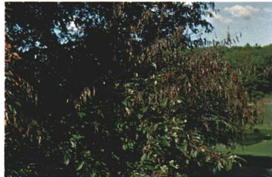
11. DIEBACK: Progressive death of branches or shoots beginning at the tips and moving toward the main stem or trunk. Usually associated with woody plants. Fireblight on crabapple.