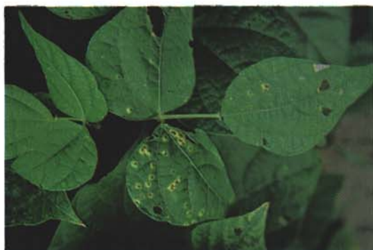
15. HALO: A spot on a leaf surrounded by a discolored (usually yellow) circle. Bean rust.