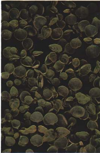
07. CUPPING: Up- or down-ward curling of the entire leaf margin forming a cup- or bowl-like shape. Gas injury to begonia.