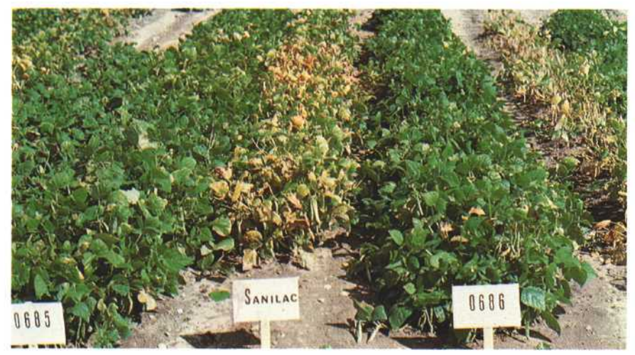
Fig. 4. New navy bean varieties with resistance to bronzing injury are being developed.