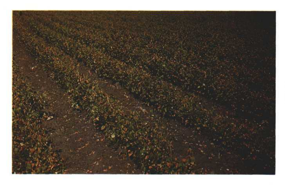
Fig. 3. Late stage of air-pollution damage showing the typical browning or bronzing of the leaves.