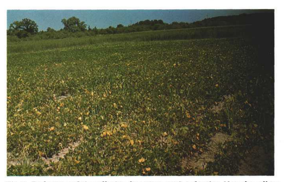
Fig. 2. Early stage of air-pollution damage on entire planting. Note the yellow appearance of the leaves.

MICHIGAN STATE UNIVERSITY · COOPERATIVE EXTENSION SERVICE