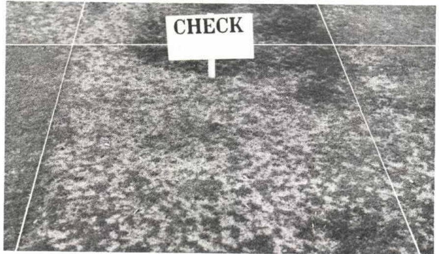
Figure 2. Entire turf areas can be destroyed when dollar spot infects non-resistant varieties, or when sound cultural and chemical controls are not used.