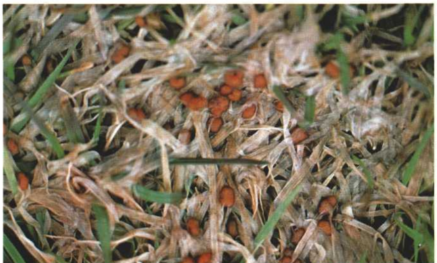
Figure 2: Close-up of gray snow mold sclerotia as seen in early spring.