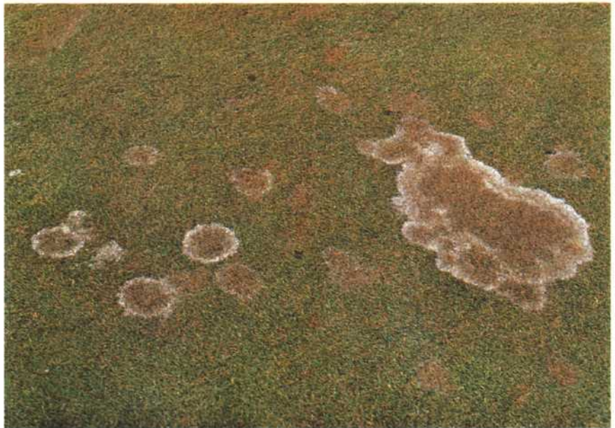
Figure 1: Typical gray snow mold diseased area showing the gray mycelium (fungal strands) at outer margins.

Typhula blight in Michigan is most commonly caused by Typhula incarnata . The Typhula fungus survives the summer as sclerotia (dormant stage). In early spring, as the snow melts, the sclerotia may be as large as \frac{3}{16} of an inch and visible to the naked eye (Fig. 2). Later, they dry up and are no longer detectable. The sclero-