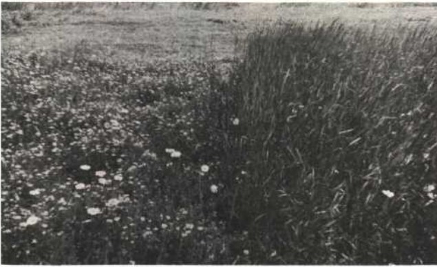
Figure 5. A grass killing herbicide (left) or tillage to control quackgrass is necessary for good trefoil stands.