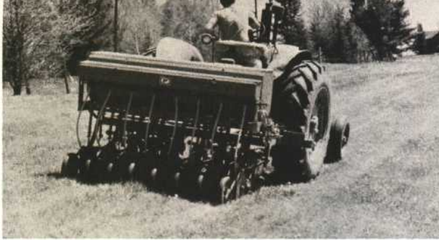
Figure 7. Sod seeding birdsfoot trefoil in Dickinson County in the U.P.