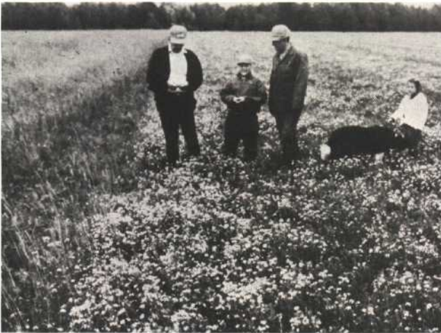
Figure 6. Seedings of birdsfoot trefoil in oats (left) on a fine textured soil in Chippewa County in the U.P. are very successful. Trefoil on the right was seeded the previous year in oats.

Method 2. Seeding with oats is much less reliable than clear seeding alone with a herbicide. Seed with 1 bushel of early-maturing oats removed (1) for pasture when 8 to 10 inches tall and regrazed again; or (2) for silage. Do not leave the oats for grain since excessive competition will generally result in seeding failures.