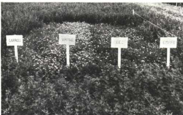
Figure 1. Birdsfoot trefoil stands in the second cutting on July 6, 1976, at East Lansing one year after seeding. Viking flowers about one week earlier than Empire and Carroll; Leo is intermediate.

Emmet sandy loam, pH 6.1-7.4, two hay cuttings/year (mid June and mid-to late Aug.), 0+80+40 fertilizer at seeding and annual topdressing with 0+80+80 starting in spring of 1955.