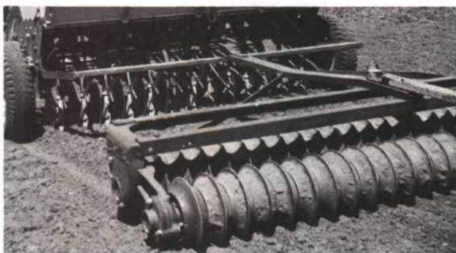
Figure 3. Firming the soil over and above seed helps insure good stands. A band seeder fertilizer grain drill with press wheels (upper photo) or a cultipacker following the drill effect shallow seeding and firming of the soil over the seed.