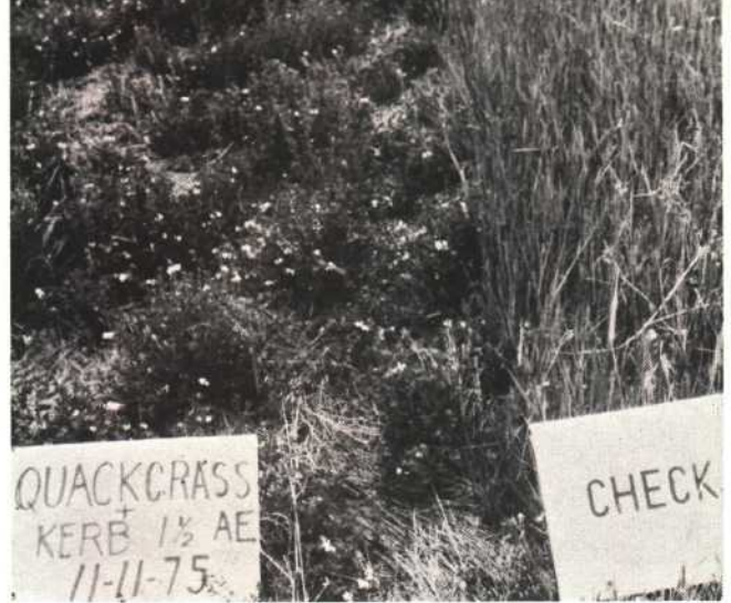
Figure 8. Kerb herbicide applied November 1-20 at 1½ lb. active ingredient per acre removes quackgrass effectively from a Viking trefoil stand invaded by quackgrass at Lake City in northern Michigan.

* Soil test - 23 lb P, 480 lb K per acre.