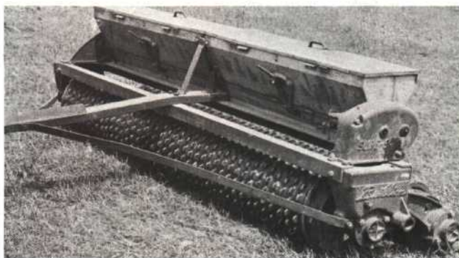
Figure 4. A Brillion cultipacker seeder places the seed shallowly and is an excellent seeding method, particularly in soils where phosphorus levels are high.

leaved weeds only. If perennial grasses such as bromegrass ( Bromus inermis L.), orchardgrass ( Dactylis glomerata L.) or timothy ( Phleum pratense L.) are seeded with the trefoil, 2,4-DB is the only herbicide which can be used.