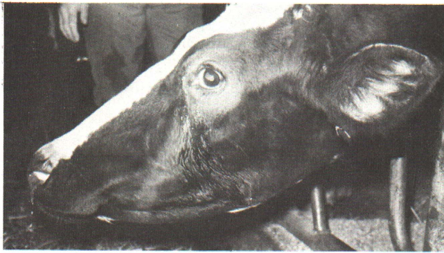
Figure 1. Signs of iodism in adult cow. Tearing of the eyes, conjunctivitis, hair loss around the eye, purulent nasal discharge in cow receiving 236 \pm milligrams iodide daily as EDDI.