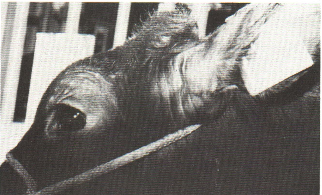
Figure 3. Hair loss around the eye occurred in calves fed excessive iodide (EDDI) in experiments at Michigan State University, but not in calves fed nutritional amounts of iodide.

Bulging or protruding eyeballs with increased amount of the white of the eye visible (exophthalmus) (Figure 5) is commonly seen in cattle fed excessive iodide for a prolonged period (1). Large fat deposits were removed from behind the eyeball (postmortum) as occurs in exophthalmic goiter.