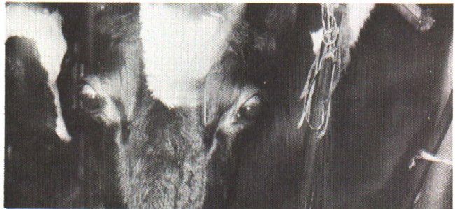
Figure 5. Protruding of the eyeballs (exophthalmus) is commonly seen in dairy cows receiving excessive iodide.