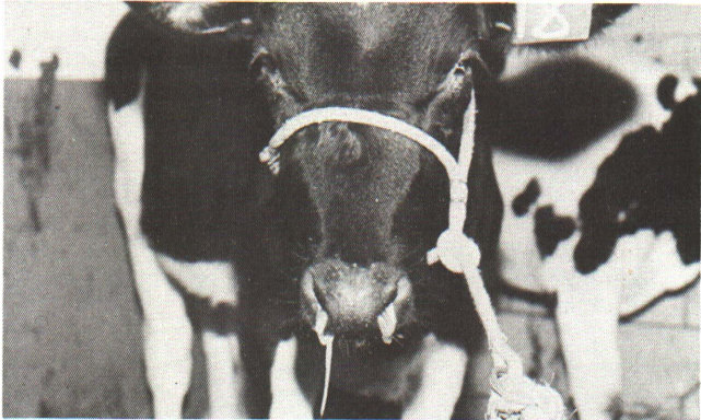
Figure 2. Purulent nasal discharge of calves fed 50, 250 and 1250 milligrams iodide as EDDI in experiments at Michigan State. Note the matted eyelids from conjunctivitis. Calves were more susceptible to infections.