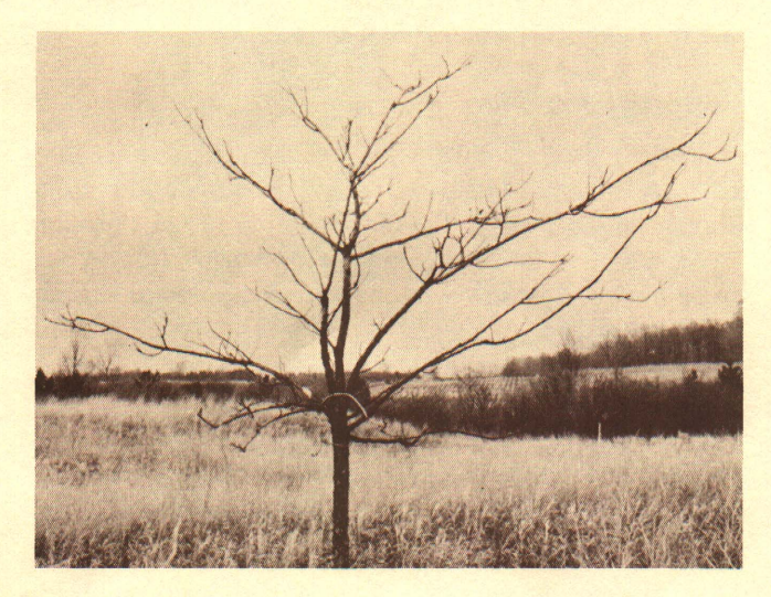
Fig. 1-Black walnut sapling with poor form resulting from repeated terminal bud damage.

Caterpillars (larvae) of two species, Acrobasis juglandis and Acrobasis demotella, feed on black walnut trees throughout the spring and summer. The feeding habits and the type of silk and frass (insect excrement) case they construct will vary, depending upon the stage of the caterpillar's development. Descriptions of feeding habits and appearance at different times of the year follow: