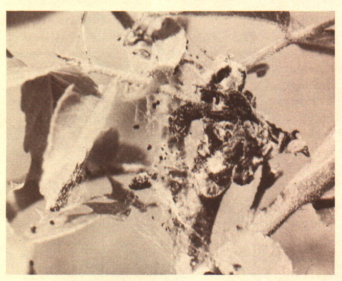
Fig. 2—Silk and frass on an expanding black walnut bud from a casebearer moth larva.

Early summer-In June, when shoots are partly developed, A. juglandis larvae move to the leaves and construct a tube-like case between two leaflets (Figure 3). They leave this shelter to feed on adjacent leaflets. In contrast, A. demotella larvae feed down