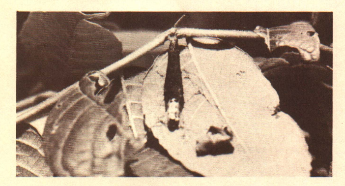
Fig. 3—Feeding shelter and pupal case of Acrobasis jug-