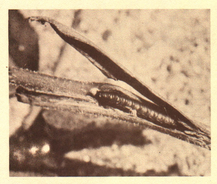
Fig. 4—Black walnut shoot split open to show Acrobasis demotella larva feeding.

the middle of shoots, resulting in the death of that shoot (Figure 4).