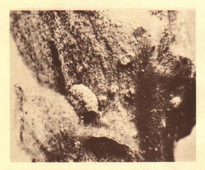
Fig. 6—Hibernacula of casebearer moth larva near lateral bud.

brown. If only the below-freezing temperatures have caused the damage, no insect remains or frass will be present. Frost damage is usually more uniform from tree to tree throughout a plantation or stand than insect injury, although it is usually more severe in localized low areas and valleys, or so-called "frost-pockets". Late spring frost and Acrobasis moths may both injure the same bud, making it impossible to name a single causal agent. Late spring frost is likely to be a perennial problem, since black walnut in Michigan is at the northern edge of its range.