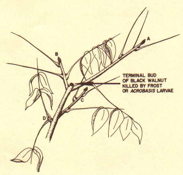
Fig. 7—Shoot A should be selected for the new terminal. Shoot B and C should be removed.

This corrective pruning technique aims to re-establish apical dominance by one shoot to correct forks which may have resulted from terminal bud injury, thus improving tree form.