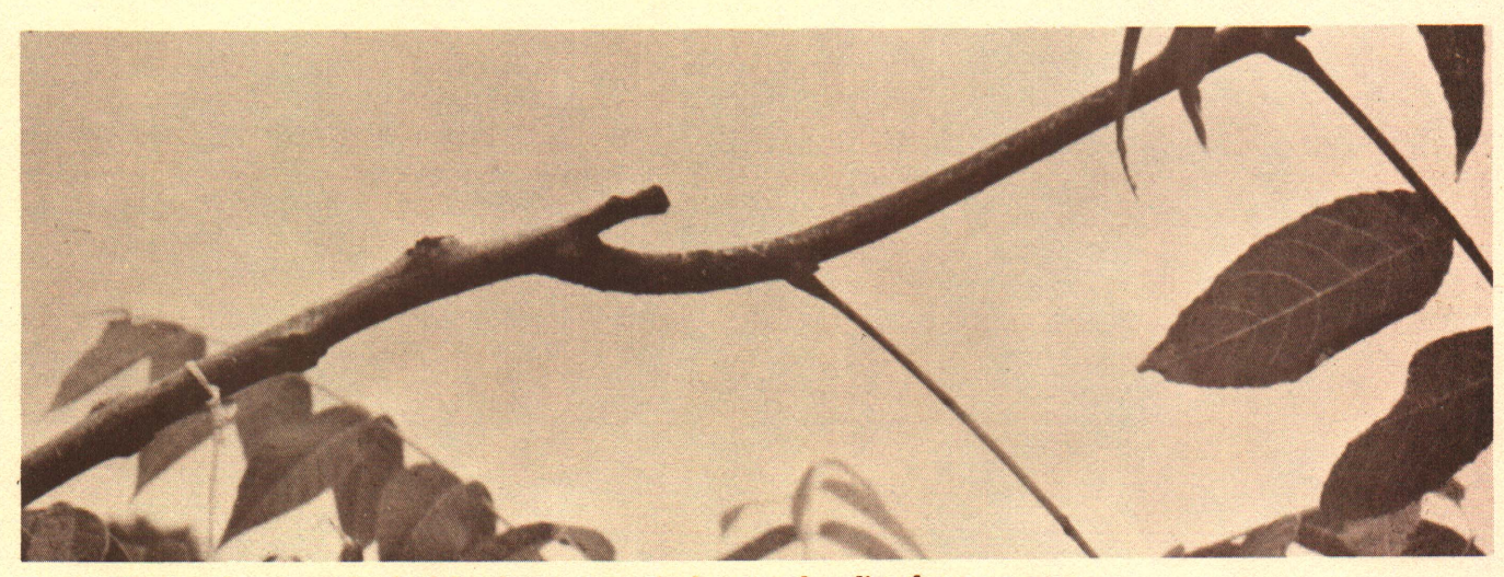
Fig. 8—Black walnut branch which has been correctively pruned earlier the same year.

If corrective pruning has not been done on trees older than 3 or 4 years and terminal bud damage has already occurred for several years, more than just the current year's growth will have to be pruned to train the tree into good form. Don't remove more than about 25% of the live crown area at one time, or growth will be slowed. If a tree is badly misshapen and less than 10 feet tall, consider coppicing. This method of regeneration relies on vegetative reproduction or sprouting. Before growth begins in the spring, poorly formed trees are cut off at ground level. Two to three weeks after several fast-growing shoots appear, all but the largest, most vigorous one should be removed. It is not unusual for a shoot produced this way to grow 5 feet or more the first year.