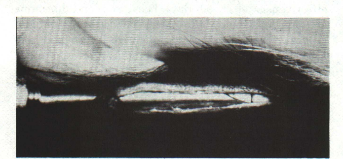
Figure 2. Cutaway view of ear showing Synovex needle withdrawn about 1/2 inch leaving space for pellets.