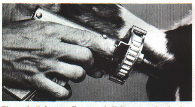
Figure 6. Ralgro needle inserted all the way under the skin. Ralgro pellets should be deposited within 1 inch of the cartilaginous ring at base of the ear.