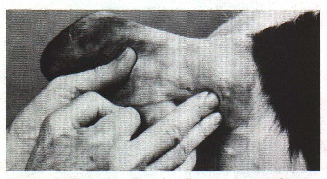
Figure 8. This ear was clipped to illustrate proper Ralgro implant site. Note the hole where needle was initially inserted.