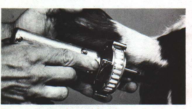
Figure 5. Inserting the tip of the Ralgro needle underneath the skin toward lower edge of ear.