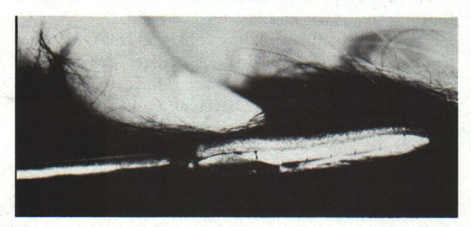
Figure 3. Cutaway view of ear showing withdrawal of Synovex needle, laying pellets in a straight line. This allows pellets to be deposited in path of needle, and avoids crushing them.