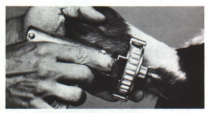
Figure 7. Before squeeezing trigger of Ralgro gun, pull back about 3/8 inch to allow room for pellets, thereby preventing crushing.