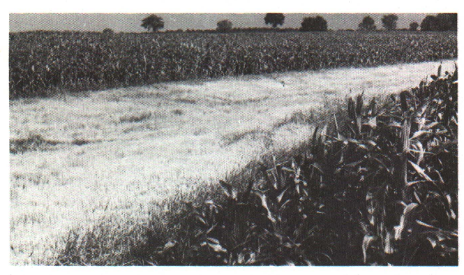
Figure 6. Grassed waterways remove surface water rapidly with little or no erosion.

Some open ditches, especially on organic and very sandy soils, are used for water table control. This is achieved through a series of dams with removable boards. The same ditches also act as surface drains during wet seasons. Open ditches should be designed by a drainage engineer who considers size of the drained area, kinds of soil, water flow velocities, channel depth, bottom width, berm width (distance from the edge of a ditch to the edge of a spoil bank), spoil bank, etc. He/she also assists with specifications for bridges, culverts, and stock and low water crossings.