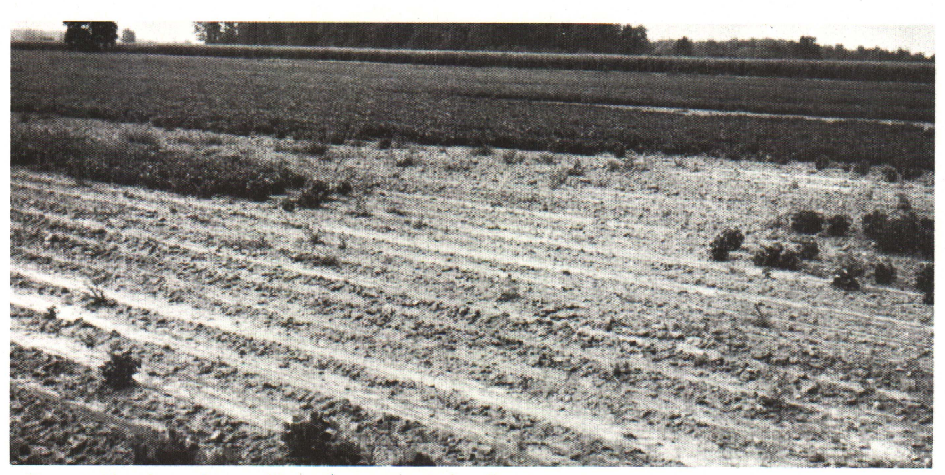
Figure 1. Navy beans destroyed by surface water which collected for only a few hours. This need not have occurred because the field is bounded on two sides with deep ditches, which could have served as outlets for surface drains.

Numerous observations suggest a great potential for improved crop yields with surface drainage even though there is little research in Michigan to substantiate the claim. Fortunately, data are available from a relatively close-by location. In Erie County, Ohio, an eight-year average increase in corn yields of 29