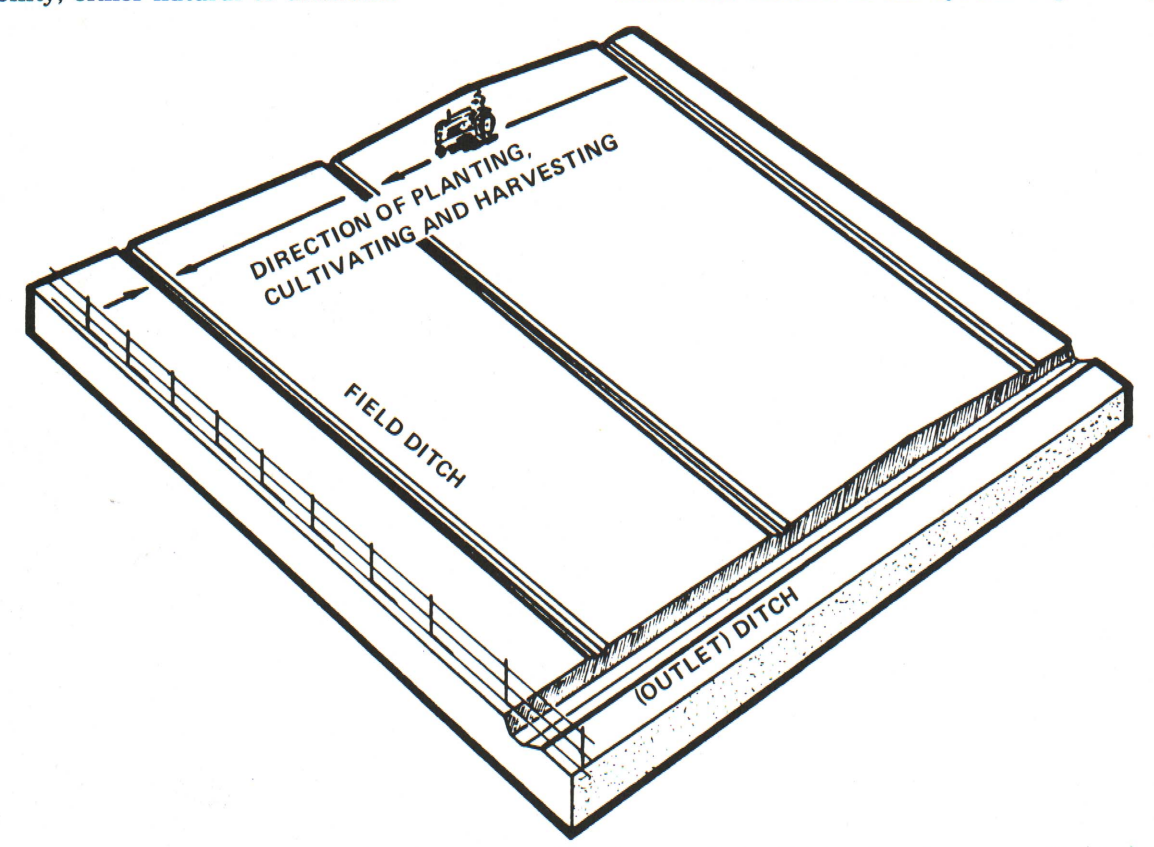
Figure 4. Parallel field ditches for surface drainage work well on nearly level fields. Spacings vary with kinds of soil and distance and amount of soil material to be moved. Make outlet ditches at least 1 foot deeper than field ditches. Grade to outlet ditch should be such that erosion does not occur.

The parallel field ditch system is well suited to the nearly level (0–2% slopes) areas of poorly drained soils where numerous shallow depressions occur (Figure 4). Where large fields can be planted up and down the slope, parallel ditches are sometimes used to break the field into shorter units. The ditch is flat enough for machinery to operate smoothly across the ditch. The success of this system depends upon pro-