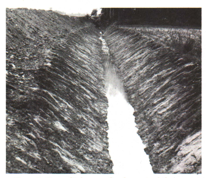
Figure 7. Open ditches can be dry part of the year or contain water. Engineers should design open ditch systems, but ideally, crop producers should maintain them. Seed grass to stabilize sides of ditch so that sedimentation does not reduce ditch depth.