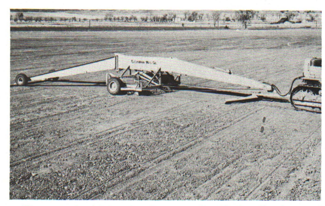
Figure 3. Land level only recently tilled soil where no crop residues or trash are exposed. A minimum of three treatments, each in a different direction, is recommended. This should be repeated one or two years later because the transported soil material will settle.

Depressions up to six inches deep and several feet across may economically be filled with the use of