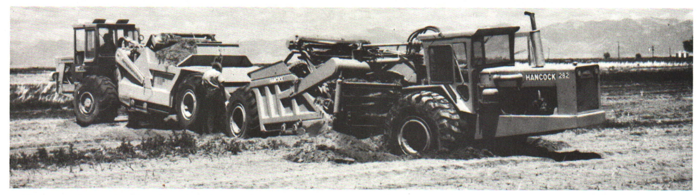
Figure 2. Land grading is a job for professionals. Here, an earthmover got stuck while preparing a field for surface drainage because the soil conditions were not correctly evaluated. Land grading should be used in Michigan with caution because surface soil layers are usually thin. Soil physical and chemical problems are common when subsoil is exposed.

Four methods have been used in Michigan to improve surface drainage: land grading, land leveling (smoothing), field ditches, and open ditches. An engineer or soil and water conservation specialist, who is knowledgeable about local weather, soil, and crop requirements can help design each system. The Soil Conservation District is usually able to provide this assistance to district cooperators.