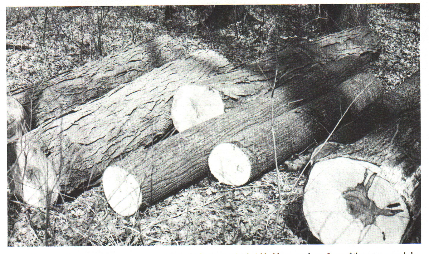
Many woodlands in Michigan can be managed to produce a sustained yield of forest products. Some of these sugar maple logs are of veneer quality.

In order to advertise a timber sale to potential buyers and to give some indication of its potential value, the landowner must determine what to sell. This involves deciding which trees or areas in the woodland are to be cut and then determining for each species the number of trees and/or the volume of wood or amount of products to be sold.